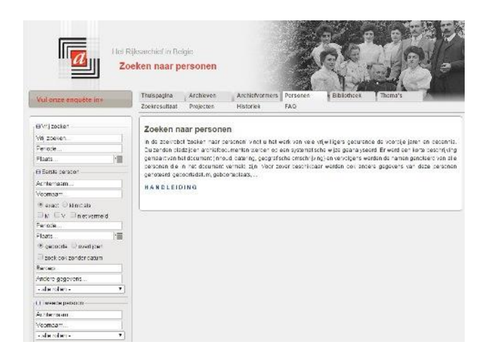
Figure 1: Homepage of the Zoeken naar Personen online search robot of the Belgian State Archives.

In order to save the mass of collected data and the many efforts that have been done, the province of Vlaams-Brabant and the Flemish heritage institution of Brussels funded a small scale heritage project in order to unlock the people's database on the internet. This will be achieved with the support of the Belgian State Archives,