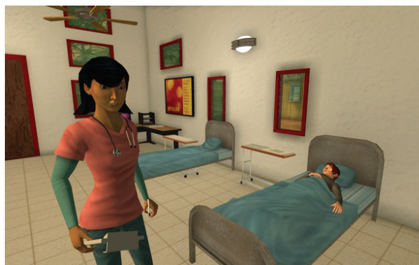
Fig 1. CRYSTAL ISLAND narrative-centered learning environment.

problem-solving mystery. Adaptively scaffolding students' reading processes is a promising direction for enhancing students' literacy skills, and has been the subject of considerable research by the intelligent tutoring systems community [3–4]. We describe how CRYSTAL ISLAND's plot and game mechanics currently incorporate story-embedded graphic organizers to scaffold students' reading comprehension processes, and outline future directions for intelligently diagnosing and fading this scaffolding.