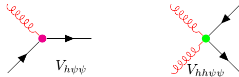
FIG. 1. The graviton–fermion cubic and quartic vertices.

where \hat{b}_{\mathbf{k}} denotes the particle annihilation operators and \hat{c}_{\mathbf{k}}^\dagger is the antiparticle creation operators. The corresponding spinors are \mathbf{U}_{\mathbf{k}}(\tau) and \mathbf{V}_{\mathbf{k}}(\tau) ; they are related by CP symmetry. At zeroth-order in h_{ij} we have 3