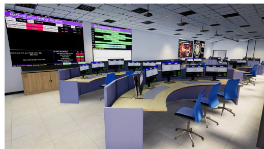
(f) ATLAS control room virtual space with the display of webpages and videos.