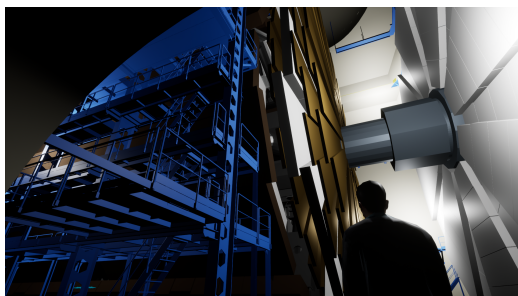
(a) View from inside the cavern.