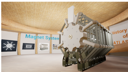
(e) Exhibition at the CERN Globe of Innovation virtual space with sub-detectors represented.