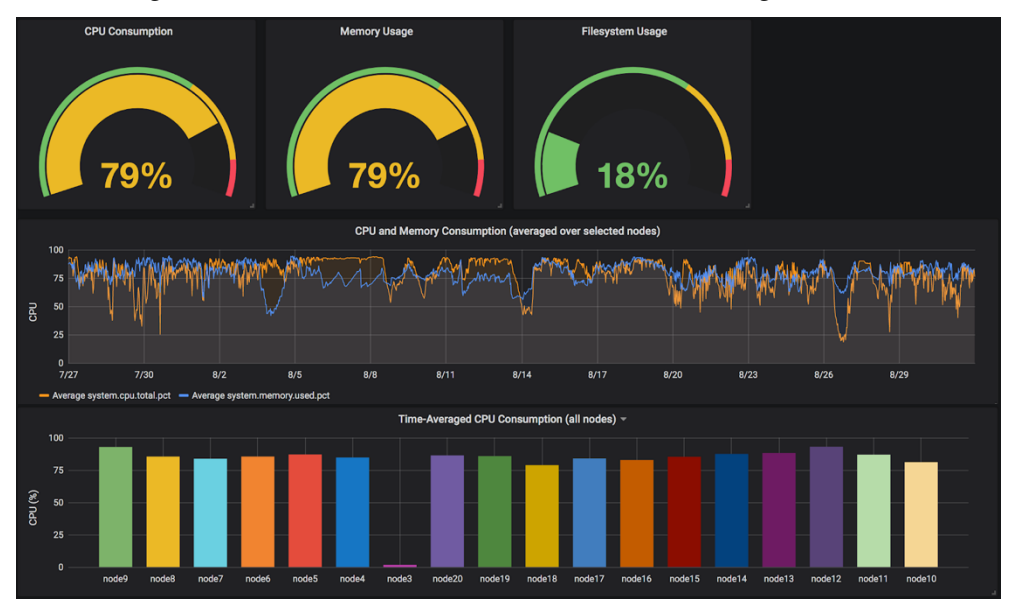
Fig. 1. Prometheus monitoring showing resource usage for one of the Kubernetes clusters

To keep the cluster secure, at UVic we configured Role Based Access Control to allow only those API actions which are suitable and necessary to run jobs on the cluster, and applied another PodSecurityPolicy to forbid privileged pods. To monitor the status and resource usage of the cluster, we use Prometheus [19], as shown in Figure 1.