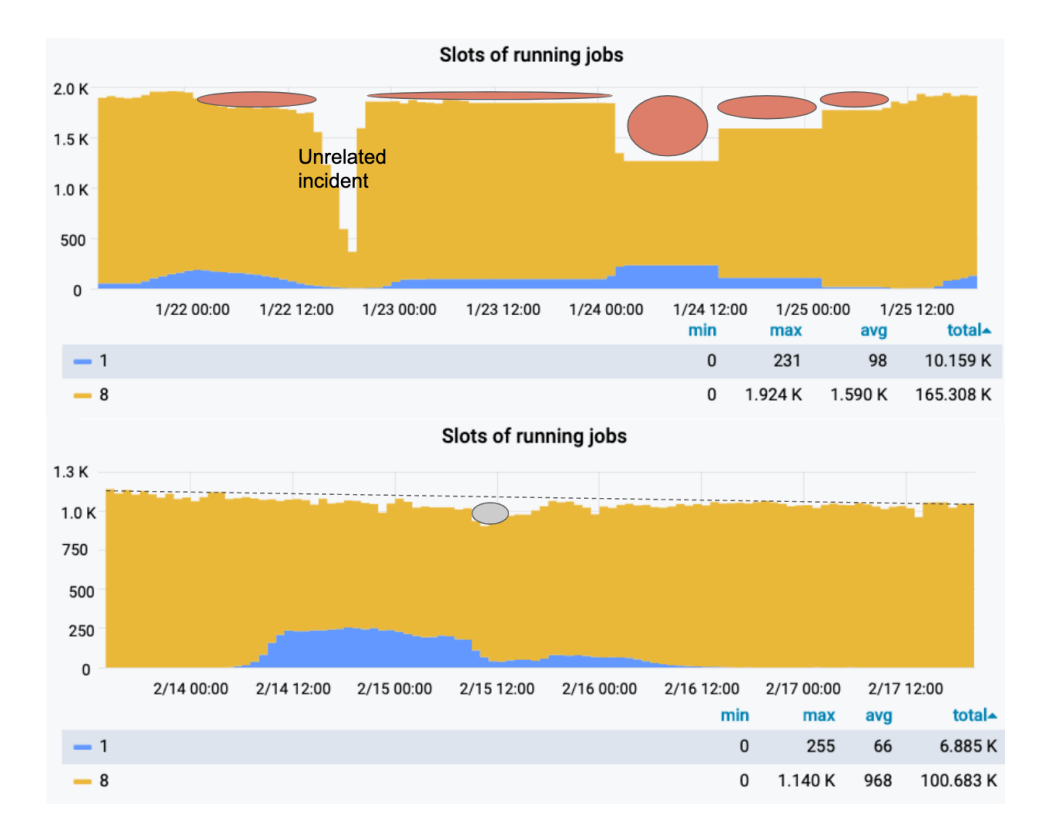
Fig. 3. CPU usage on the CERN Kubernetes cluster with the default scheduling algorithm (top) vs the node-packing policy (bottom). Resources that are unused due to inefficient scheduling are indicated with red ellipses. Also note the cluster size decreased from 2000 cores to 1000 cores, due to issues with the csi-cvmfs driver and the infrastructure at CERN, which were addressed at the time.