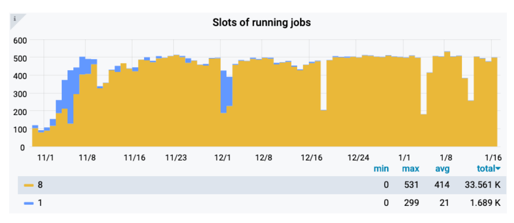
Fig. 5. Stable operations of the 500-core UVic production cluster CA-VICTORIA-K8S-T2. The abrupt brief dips in usage are due to scheduled downtimes for network maintenance external to the site