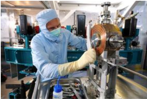
Figure 4: An EMMA RF cavity under test.

The ultimate performance on the accelerator will be the ability of the cavities to efficiently transfer energy to the beam. For EMMA, a normal conducting single cell re-entrant RF cavity design has been optimised for high shunt impedance, working within geometrical constraints of 40 mm beam aperture and 110mm flange to flange length availability. The custom in-house design shown in figure 4 meets the operation specification.