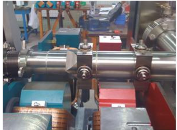
Figure 5: An external view of two 4-button BPMs. The top halves of the neighbouring ring magnets have been removed.

before EMMA, in the ring and destructive devices are mounted in an external diagnostics beam line. The injection line is instrumented with 4 beam position monitors (BPM), 6 motorised YAG screens, including 3 in a tomography section for measuring the beam emittance, a wall current monitor and a Faraday cup, onto which the beam can be directed. In the ring, there will be 2 BPMs per cell (see figure 5), except around the injection and extraction regions, where there is insufficient space for 1 device in each region. There will be 4 motorised YAG screens that can be moved into and out of the ring. These will be driven in from the outside of the ring and will have no support on the inner face. This will make it possible to move the screen so that it sees higher energy orbits, while the lower energy orbits will be undisturbed. There will also be a wall current monitor in the ring.