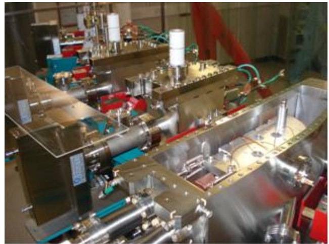
Figure 3: The injection septum and kicker magnets mounted on the injection girder. Note that the top half of each ring magnet has been removed, as has the top flange of the septum box.

the beam. The resulting injection septum and the 2 injection kickers are shown in figure 3. Note that these achieve all the requirements other than the leakage field of the septum and oscillations in the kicker fields after the 55ns fall time. It is believe that these problems can be dealt with in other ways.