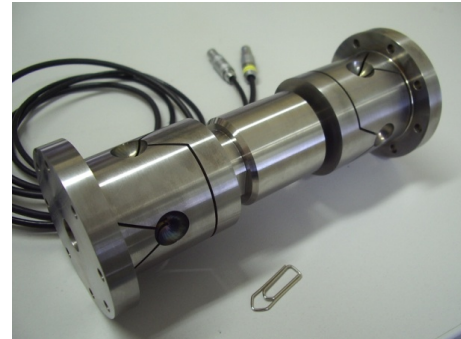
Figure 1: Actuator with two prototype hinges.

inclined actuator pairs in the same plane. The “roll” or rotation around the longitudinal axis is not suitable and should hence also be blocked by the guidance.