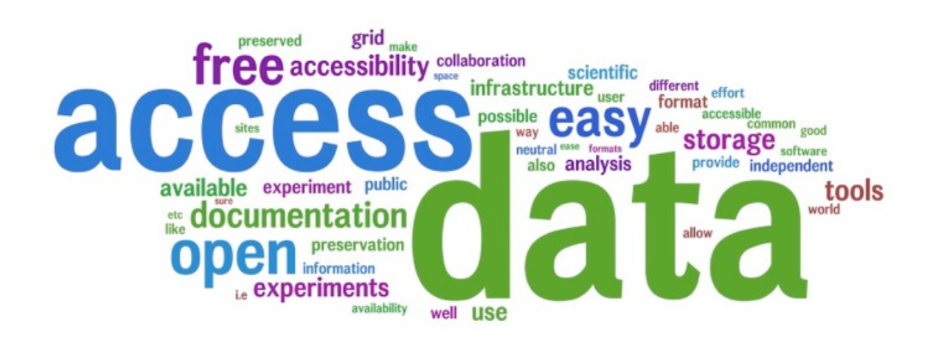
Figure 3: Main attributes of an e-Infrastructure for HEP data preservation and access

by the timing that researchers indicate as crucial for the success of a data preservation program: 41.4% of the respondents think that the effort towards data preservation has to be deployed concurrently to data taking, while 28.1% think that preservation should be prepared even before the actual data taking. It is remarkable that participants to the LHC experiments strongly indicate that data preservation should be addressed before data taking, which means now !