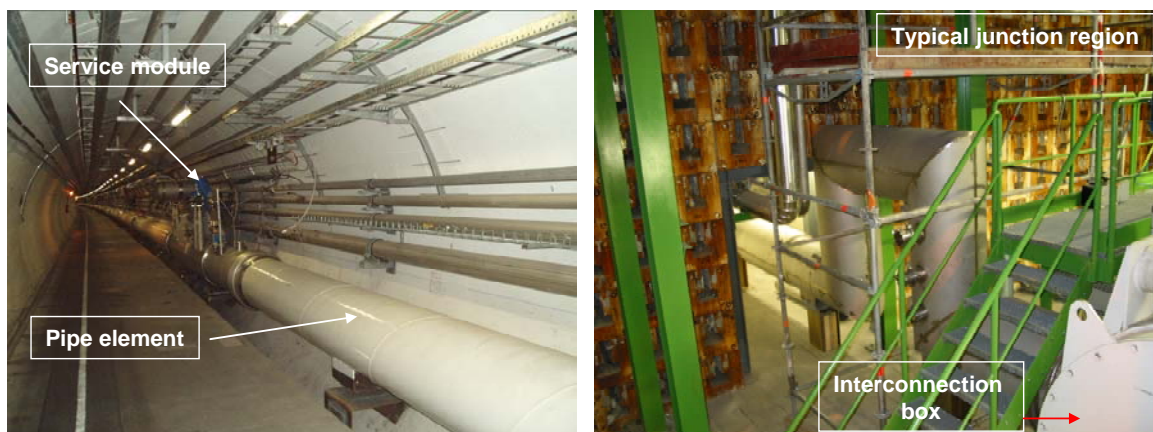
Figure 2: Typical QRL elements and junction region layout

Each sector is composed of 238 straight pipe elements (90 % are standard elements), 30 vacuum barrier and fixed point elements, 38 service modules (of 15 different types), 10 singularities such as steps and elbows. The series productions have been subcontracted to 5 European industrial companies, each one dedicated to particular types of modules: a joint venture Air Liquide / 2C (France) for the standard pipe elements, Simic (Italy) for specific and standard service modules, FCM (Spain) for standard service modules, Tuboplan (Portugal) for specific pipe elements, vacuum barrier and fixed point elements, and singularities, Air Liquide DTA (France) for standard service modules and specific double-jumper service modules.