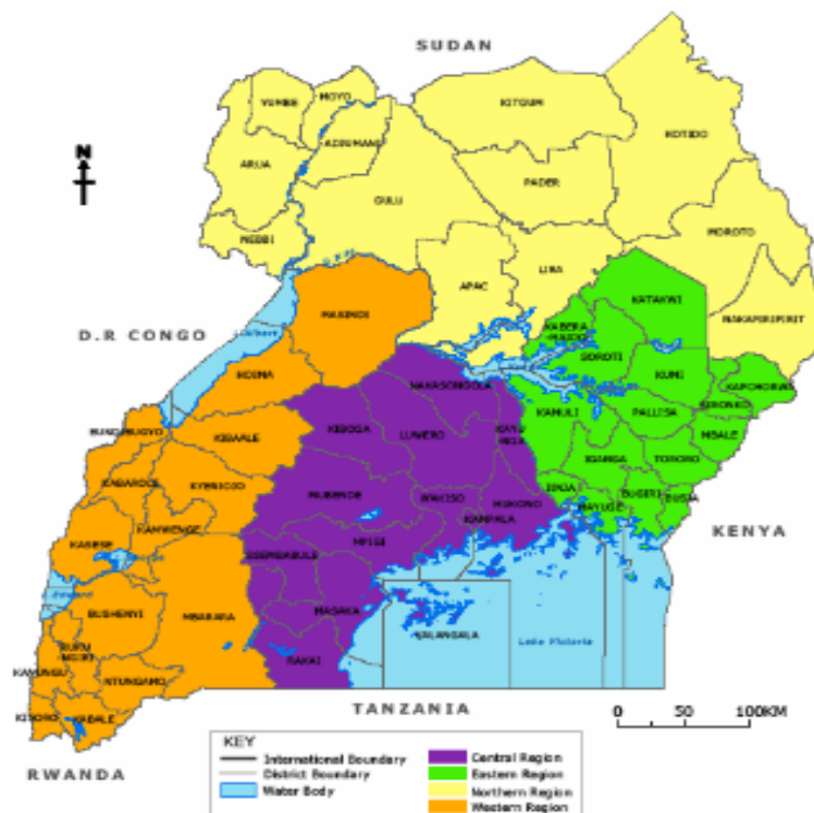
FIGURE 1a Map of Uganda showing the Central, Eastern, Northern and Western regions.

The Republic of Uganda is a landlocked country in East Africa, and has seen an increase in life expectancy from 39 years in 1950 to 64 years in 2021[13], and is thus beginning to experience an increase in the diseases of an aging population. Statistically, Uganda is divided into four regions: Central, Northern, Eastern and Western and administratively into 146 districts, with 70,626 villages. The Uganda population is estimated at 47 million, with a population density of 593 people per mi 2 , and 25.7% of the population being urban[14]. Figure 1a shows the statistical, not administrative, regions of Uganda; Figure 1b shows the current administrative districts of Uganda. In general, Lugbara (Lugbarati) and Luo are spoken in the Northern Region; Ateso in the Eastern Region; Runyankole-Rukiga and Runyoro - Rutoro in the Western Region and Luganda in the Central Region and part of the Eastern Region.