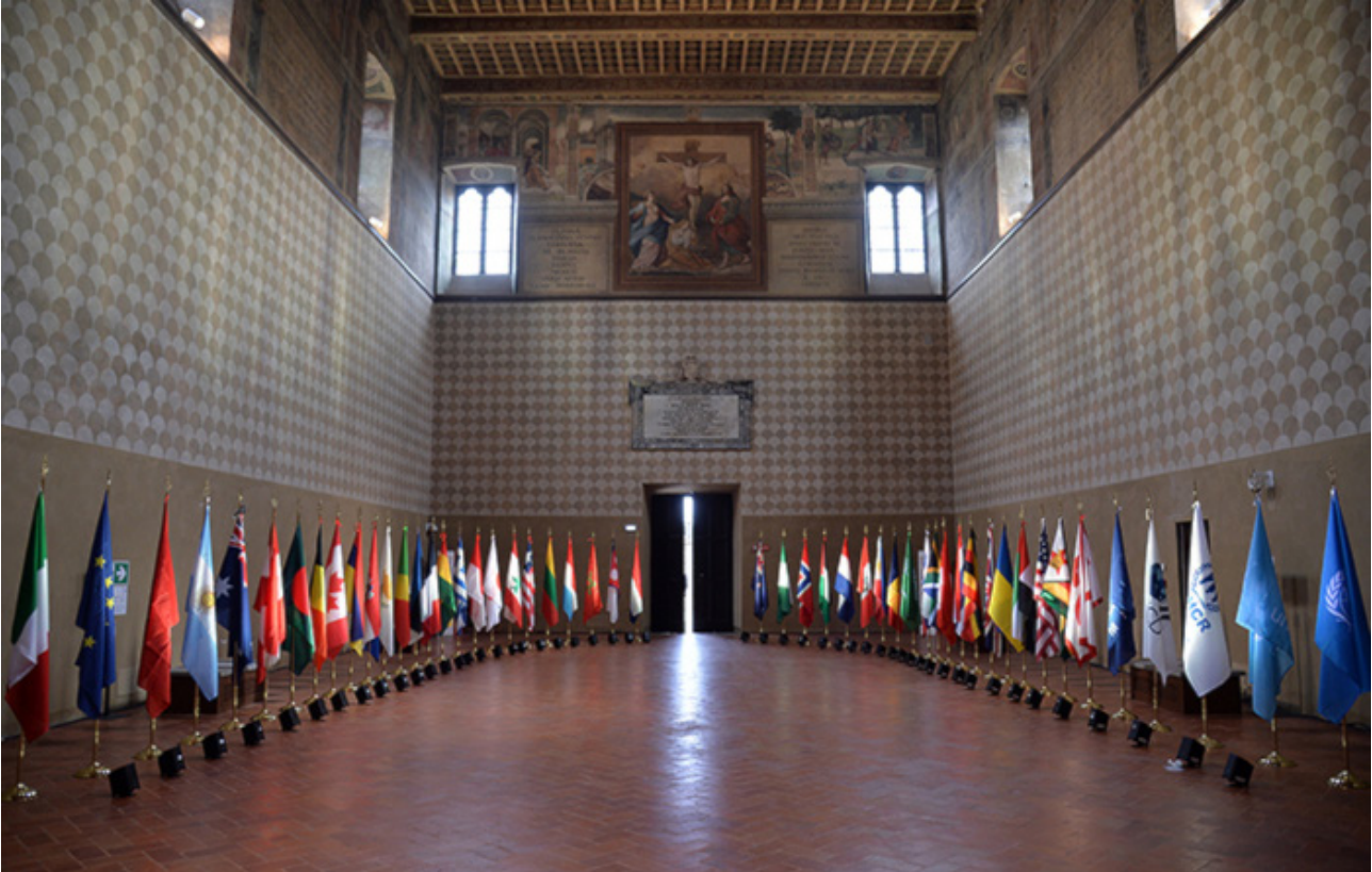
Flags of delegations represented at the GMHS 2022

The Summit proceeded along the roadmap launched in London in 2018 by further increasing mental health awareness and commitment, among policymakers and the civil society.