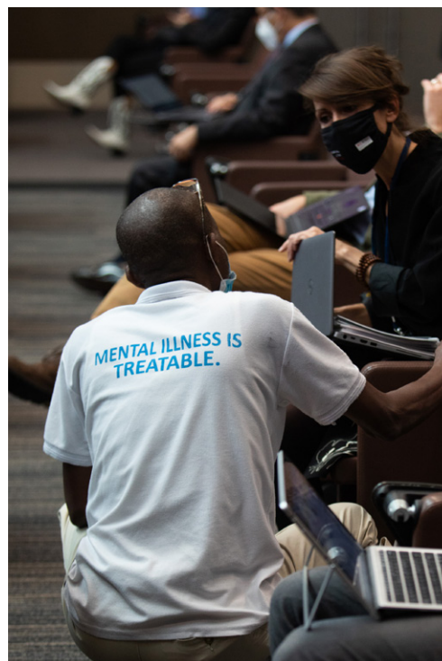
NGOs (here Unicef) contributed to the debates in Paris

https://sante.gouv.fr/IMG/pdf/sommet_mondial_sante_summary_document_en.pdf