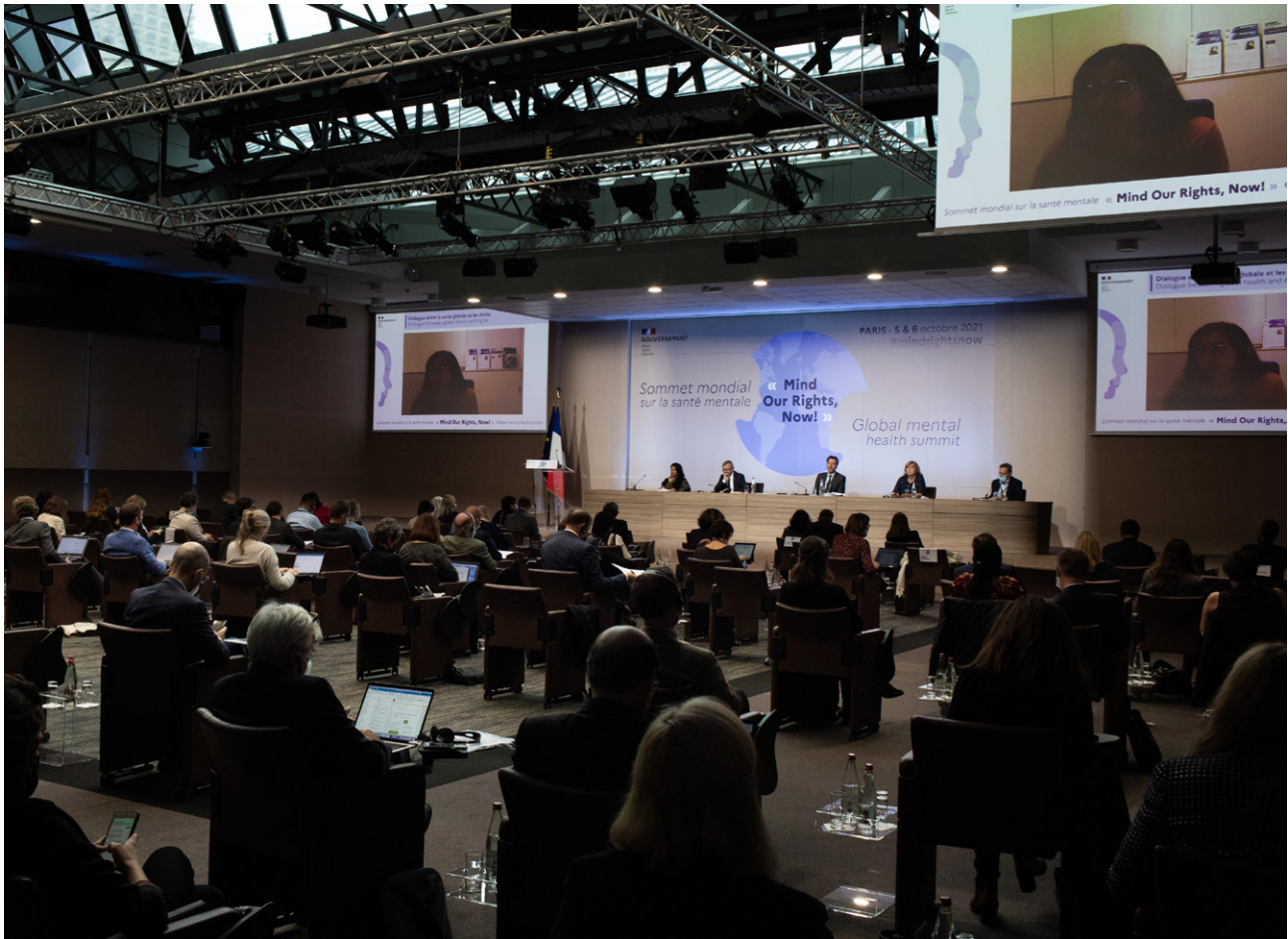
Plenary session in Paris on “Dialogue between global health and rights”

The Paris summit “Mind Our Rights, Now!” was co-organized by the Ministry of Health and the Ministry for Europe and Foreign Affairs and was held on October 5 and 6, 2021 at the Convention Center of the Ministry Foreign Affairs in Paris.