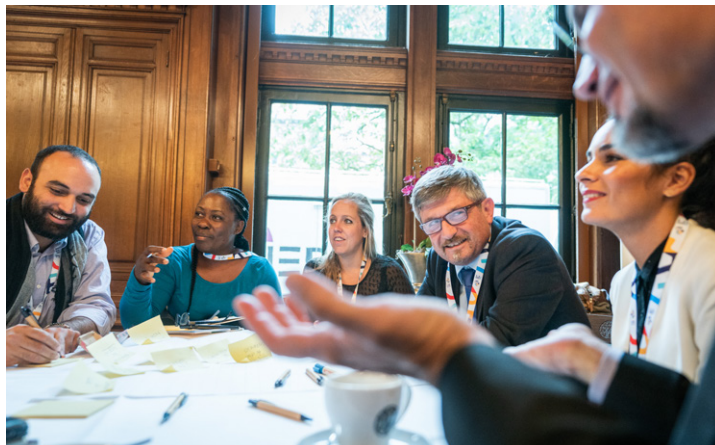
In-depth sessions served to prepare universal, practicable recommendations

The level to which MHPSS has become a subject which gets attention from national and local authorities as well as from both funding and implementing organizations, can be seen for example when looking at this mapping of MHPSS-initiatives in Ukraine. The quantity of activities in this field is encouraging; it also underlines the need for coordination and quality support.