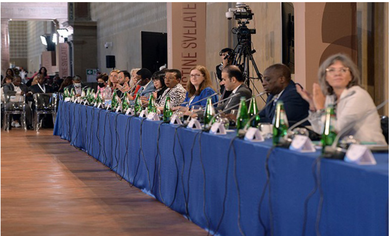
Snapshot of the Interventions by Heads of Delegations during GMHS 2022