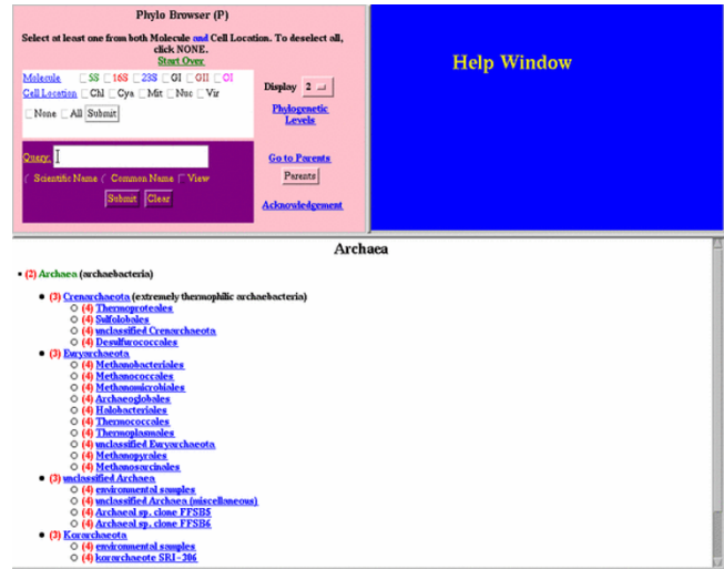
Figure 4 RDBMS (PhyloBrowser) basic phylogenetic search screen, showing two additional levels of phylogeny.

Each entry is associated with a NCBI phylogeny listing that can be retrieved in a new window by clicking the "m" button in the Phylogeny column. This listing also contains the known common names associated with each level of the phylogenetic tree (H-4A.4). The phylogeny for all of the entries in the results window is available in a new window when the "M" button in the header line of the phylogeny field is clicked.