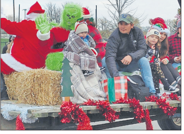
The Grinch waved to community members as the Christmas parade headed north on Main Street in New Castle.