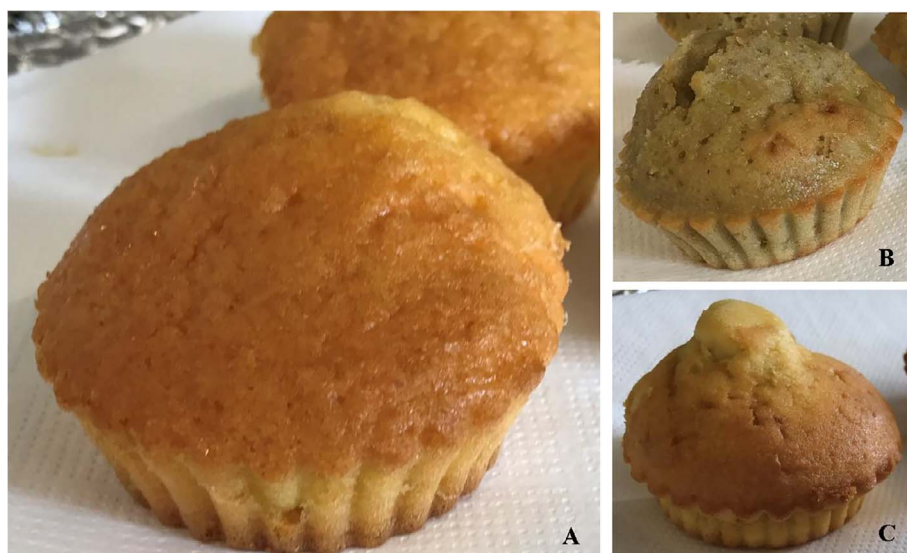
Fig. 1. Appearance of cupcakes samples along shelf life (A) cupcake control, (B) cupcake with lemon balm extract rich in rosmarinic acid and (C) cupcake with potassium sorbate.

also affected cooperatively by CF and ST, except in the case of myristic acid (C14:0) and palmitic acid (C16:0). Regarding the individual effect of each factor, caproic acid (C6:0), C14:0 and stearic acid (C18:0) did not show significant variation among different CF, in line with that verified for lauric acid (C12:0) and C14:0 concerning the ST effect. Accordingly, it was only possible to present the statistical classification in the case of C16:0, which showed the highest values in cupcakes functionalized with ERA and in non-stored cupcakes, for each respective factor. In the remaining cases, it was possible to conclude that butyric acid (C4:0) presented lower values ( 4 \pm 1\% ) in cupcakes with ERA and in control cupcakes ( 4 \pm 1\% ), C6:0 ( 2.3 \pm 0.4\% ) and capric acid (C10:0) ( 3.2 \pm 0.5\% ) presented lower percentages at the preparation day, C10:0 ( 4.3 \pm 0.5\% ) and C12:0 ( 4.5 \pm 0.4\% ) showed higher levels in cupcakes without additives (control), C18:0 tended to lower values ( 9.5 \pm 0.4\% ) after 5 days of storage and oleic acid (C18:1n9) presented lower percentages in control ( 23 \pm 1\% ) samples and in non-stored ( 28 \pm 1\% ) samples. The same tendencies were reflected in grouped fatty acids (SFA, MUFA and PUFA), mostly showing a higher tendency towards saturated fatty acids with storage, when compared to the more sensitive unsaturated forms.