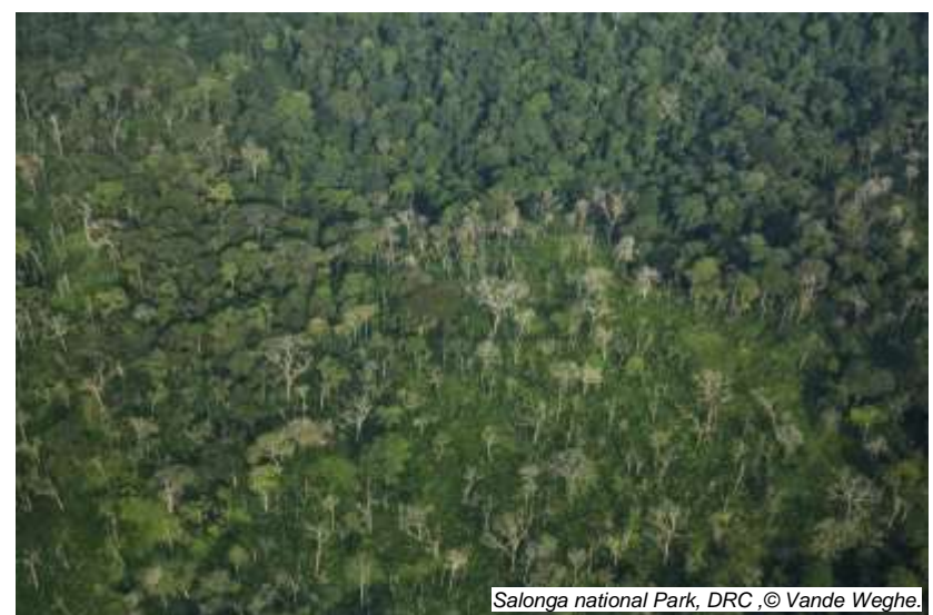
Salonga national Park, DRC ,© Vande Weghe.