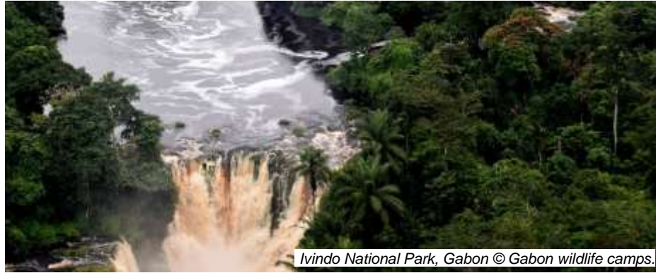
Ivindo National Park, Gabon

“The inscription by UNESCO of the Ivindo National Park on the List of World Heritage is a reward to the efforts of Gabon in the field of forest protection, whose role is decisive in the fight against global warming. A great day!” H. E. Ali Bongo Ondimmba, president of Gabon tweeted.