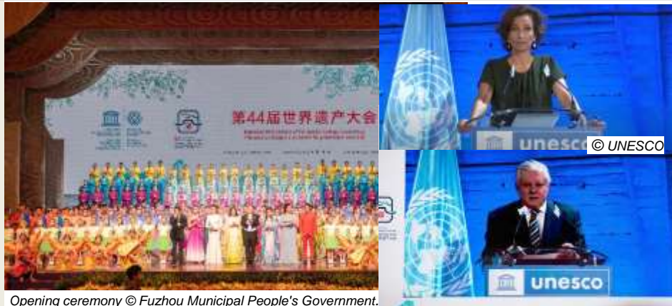
Opening ceremony

The World Heritage Committee inscribed 34 new properties on the World Heritage List with 2 properties from Africa. The committee also approved the extension of 3 properties on the List.