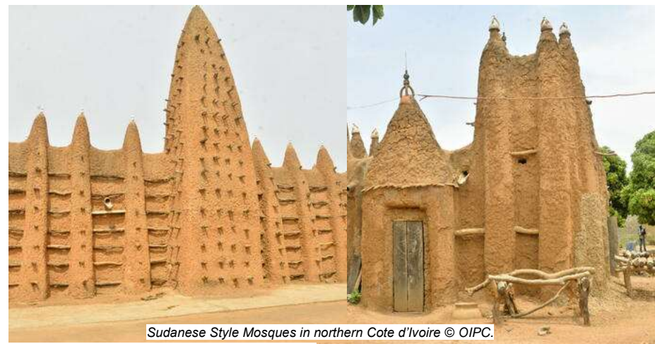
Sudanese Style Mosques in northern Côte d'Ivoire © OIPC.

“...It is with great joy that I welcome the World Heritage Committee decision to inscribe the Ivindo National Park on the UNESCO World Heritage List. This masterpiece of nature fully deserves this World Heritage designation...” Prof. Lee White, Minister of Water, Forests, Sea and Environment, Gabon