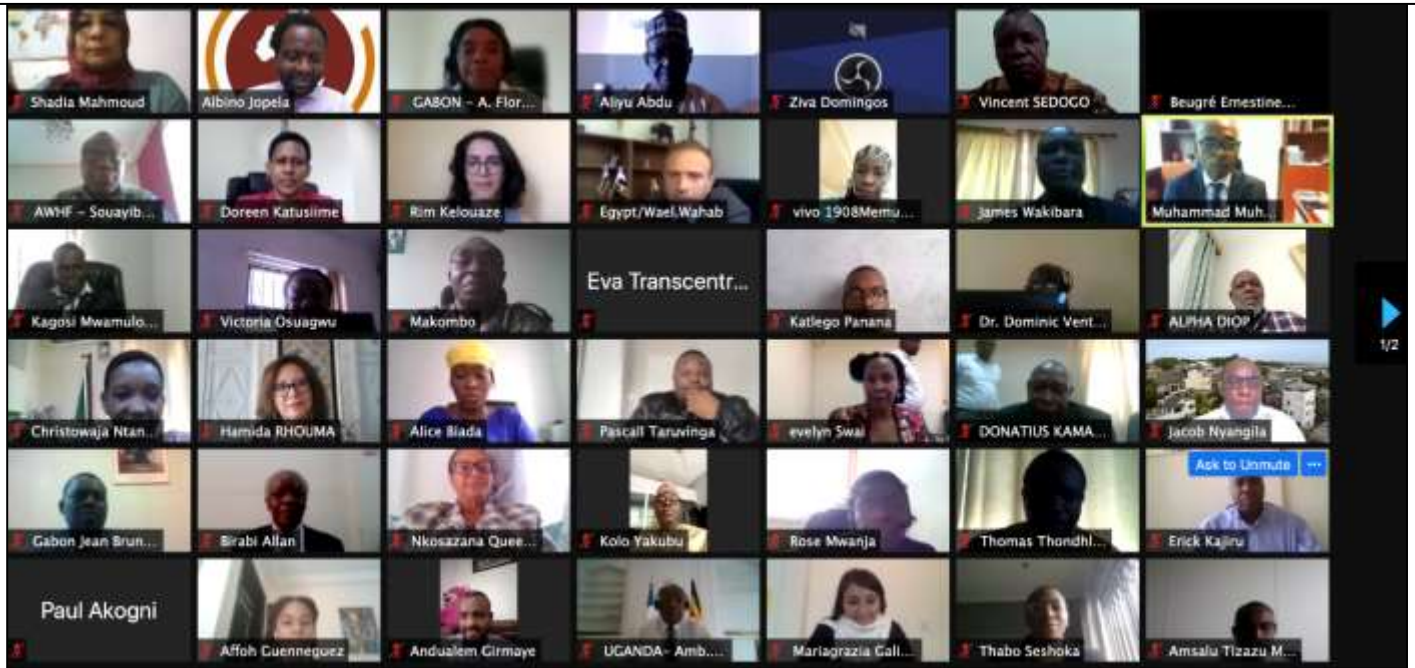
Participants, 5 th meeting of the African Experts to the World Heritage Committee, 30 th June – 2 nd July 2021

Prior to the extended 44 th extended session of the World Heritage Committee, the African World Heritage Fund in collaboration with Uganda organized from 30 th June to 2 nd July 2021 the 5 th Meeting of the African Experts to the World Heritage Committee in preparation for the World Heritage Committee session. The meeting aimed at brainstorming and finding a common approach to issues raised in the reports to the World Heritage Committee, including State of Conservation Reports and proposed nominations from Africa.