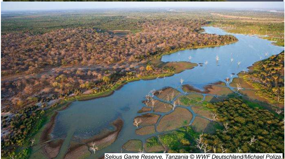
Selous Game Reserve, Tanzania