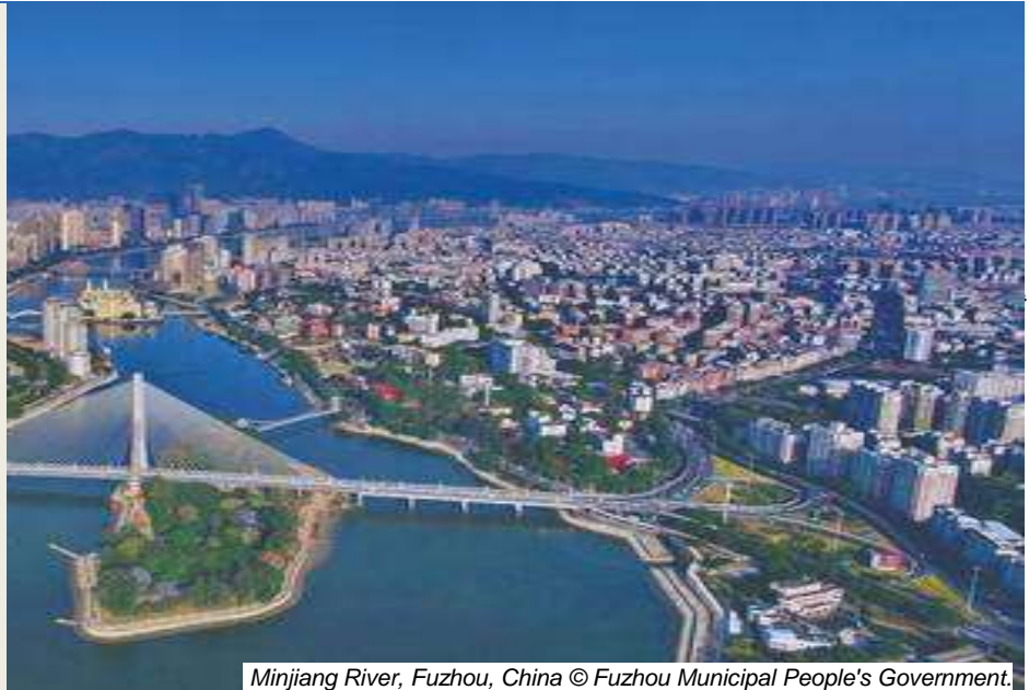
Minjiang River, Fuzhou, China

A consensus obtained on Sites of Memory and the World Heritage Convention . The Committee decided to create an open-ended working group of States Parties to continue reflecting on the matter.