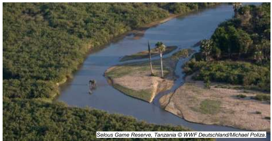
Selous Game Reserve, Tanzania