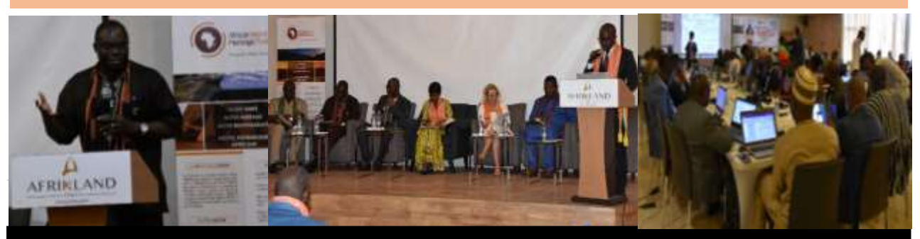
3<sup>rd</sup> Cycle of Periodic Reporting Exercise Sessions and Training in progress - Grand Bassam, Cote d' Ivoire

The Focal Point will have to continue the work at home and engage with site managers to do the same exercise at site level. The AWHF appointed a coordination and mentorship team to guide the work and provide technical assistance. Preparation is ongoing for the next workshops that will gather site managers in Nairobi (Kenya) and Yaounde (Cameroon) in February and March 2020