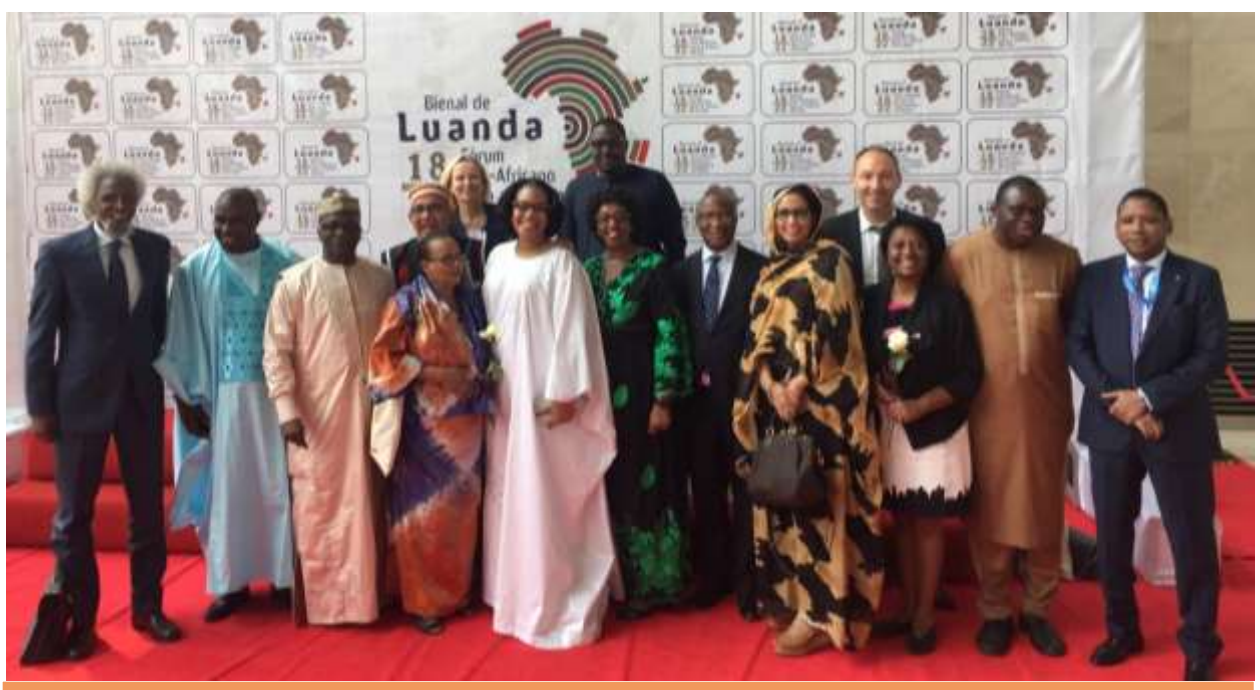
AWHF with dignitaries attending the Biennale of Luanda: Pan-African Forum for the Culture of Peace in Angola

The 2019 Biennale of Luanda: Pan-African Forum for the Culture of Peace took place in Luanda, Angola, from 18<sup>th</sup> to 22<sup>nd</sup> September 2019. UNESCO in partnership with the African Union (AU) and Government of Angola organized the event. It was part of the implementation of the United Nations (UN) Agenda 2030, in particular, Sustainable Development Goal 16 (SDG 16) and the Aspirations of the African Union Agenda 2063 and its initiative (Agenda for peace and silencing the guns by 2020). Furthermore, it aimed to promote a culture of peace and non-violence in Africa, recognized by the UN General Assembly who designated UNESCO as the lead agency for a series of prominent global initiatives for promoting peace. AWHF attended the event with the objectives to meet with His Excellency, Mr. Ibrahim Boubacar Keita , President of the Republic of Mali and African Union (AU) Champion for Culture, Arts and Heritage. The intention was to get his approval and update him on the AWHF Fundraising Side Event that he will host in favour of AWHF in Addis Ababa, Ethiopia at the AU Assembly in February 2020. AWHF also wished to engage and follow up with country representatives and key partners present at the event.