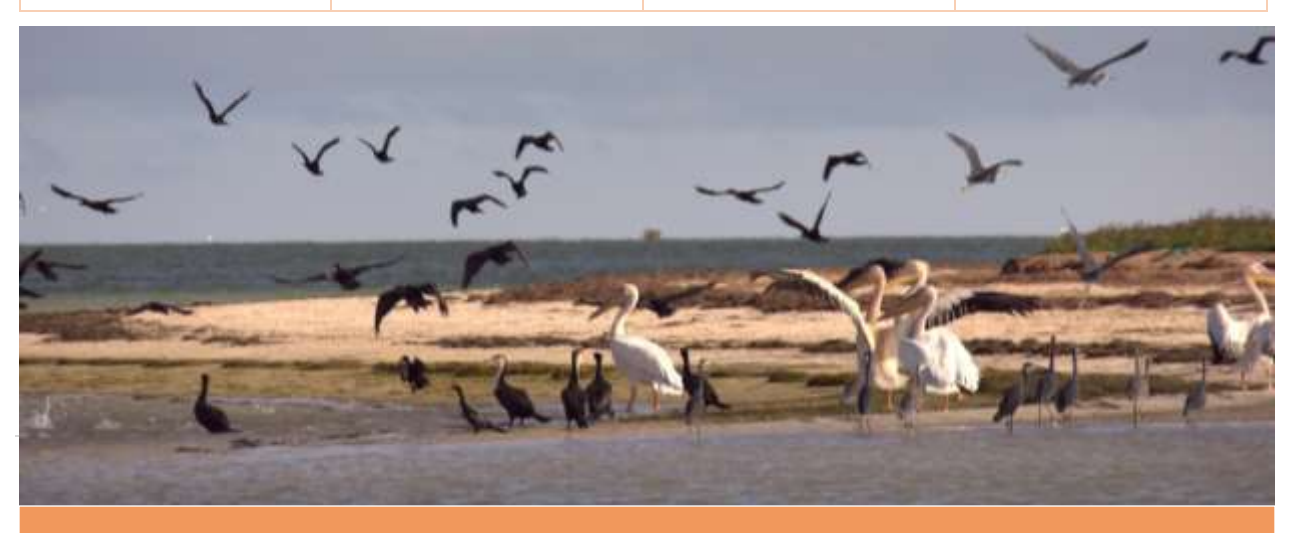
Banc d'Argum National Part World Heritage Site in Mauritania