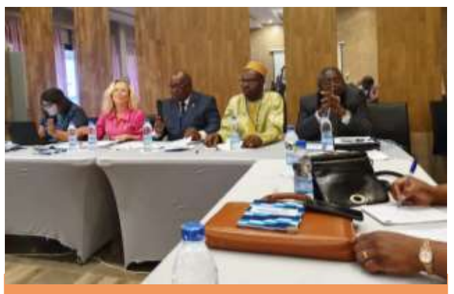
Proceedings of the World Heritage Annual Expert Meeting underway

AWHF featured at the Regional Workshop for the presentation and validation of the study report carried out on African Cultural policies which took place from 9<sup>th</sup> to 10<sup>th</sup> September in Grand Bassam, Cote d' Ivoire. The study on cultural policies in Africa was carried out within the framework of the United Nations Agenda 2030. This gathering coincided with the launch of AWHF's 3<sup>rd</sup> Cycle of Periodic Reporting Exercise for the Africa Region.