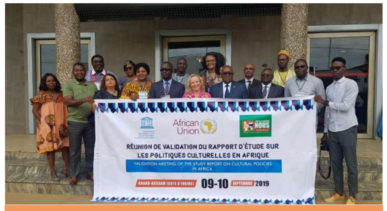
Group photo: Participants attending the ICCROM, Africa Programme in South Africa

AWHF featured at the Regional Workshop for the presentation and validation of the study report carried out on African Cultural policies which took place from 9<sup>th</sup> to 10<sup>th</sup> September in Grand Bassam, Cote d' Ivoire. The study on cultural policies in Africa was carried out within the framework of the United Nations Agenda 2030. This gathering coincided with the launch of AWHF's 3<sup>rd</sup> Cycle of Periodic Reporting Exercise for the Africa Region.