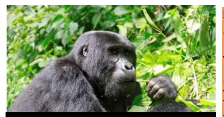
Gorilla at Bwindi Impenetrable Forest World Heritage Site – Uganda

AWHF with Faraja Africa Foundation and the Africa Youth Exchange Programme (AYEP), in partnership with the Ugandan National Commission for UNESCO, organized a World Heritage Volunteers Youth Camp under the theme, 'Obuwangwa Bwafe Munfuna' (Our Heritage as a Source of Income). The World Heritage Volunteers Youth Camp was held at Bwindi Impenetrable Forest in Uganda from 27<sup>th</sup> July to 5<sup>th</sup> August 2019. It was a platform for young people to raise awareness of Bwindi Impenetrable Forest World Heritage Site and to engage fellow youth in Africa to assist with its promotion and with the sustainable development around the World Heritage site.