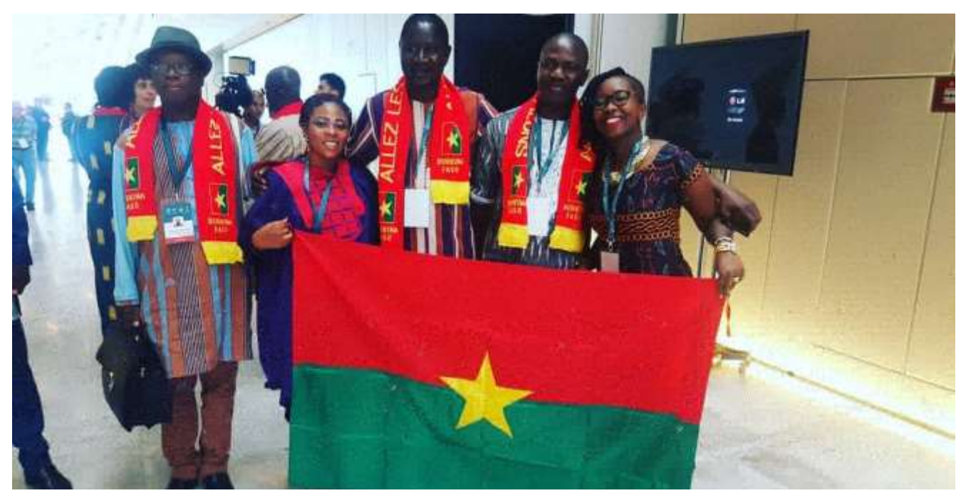
Minister of Higher Education, Scientific Research and Innovation – Burkina Faso, Hon. Professor Alkassoum Maiga celebrates the announcement of the inscription of Burkina Faso's Ancient Ferrous Metallurgy Sites on the Unesco World Heritage List

The inscription is achieved through efforts by many Stakeholders working closely with AWHF including the World Heritage Committee members (Angola, Tanzania, Tunisia and Zimbabwe), the World Heritage Centre and Advisory Bodies. As well as the Centre for Heritage Development in Africa (CHDA) and the School of African Heritage (EPA).