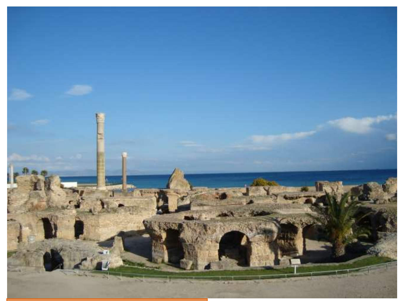
Archeological Site of Carthage (Tunisia)