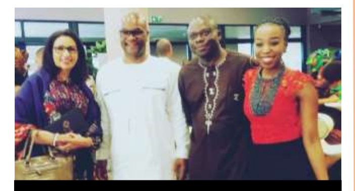
AWHF with Mr. Hon. Nathi Mthethwa, Minister of Sports, Arts and Culture, South Africa

AWHF AT THE LAUNCH OF THE SOUTH AFRICAN NATIONAL HERITAGE DAY WITH HONOURABLE NATHI MTHETHWA, MINISTER OF SPORTS, ARTS AND CULTURE