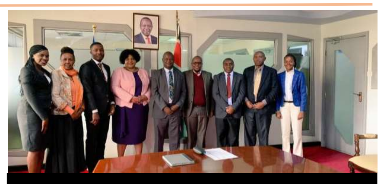
AWHF had fruitful deliberations with the Ministry of Information and Communications in Nairobi, Kenya on operationalization of the African Audiovisual and Cinema Commission and ratification of the Charter for African Cultural Renaissance. AWHF was created after the adoption the Charter in 2006 by the African Union (AU)