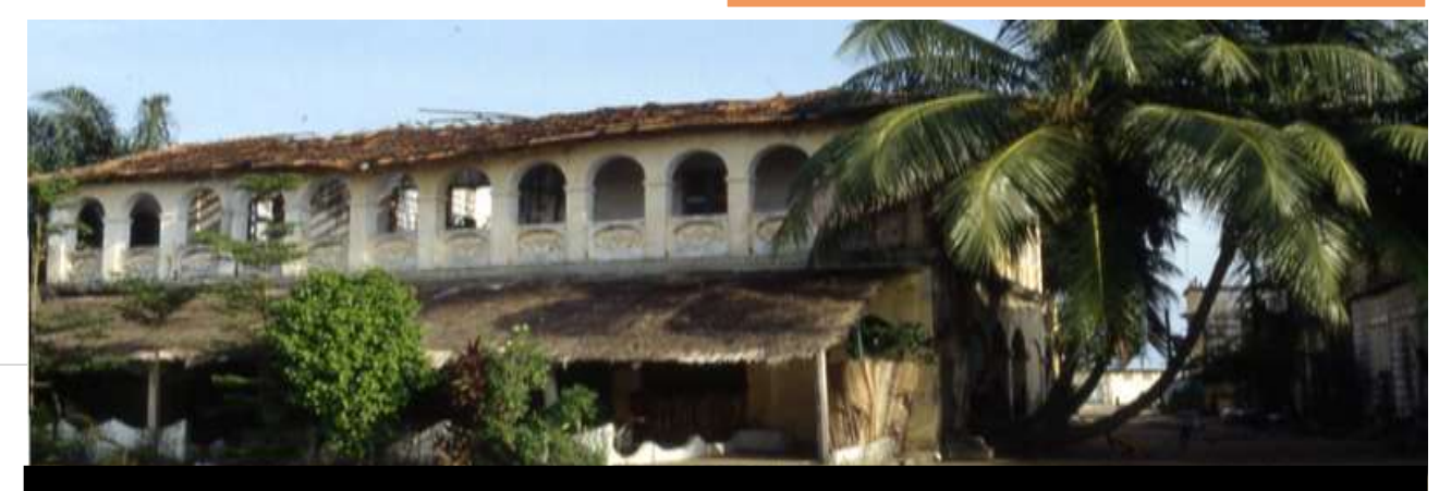
Historic Town of Grand Bassam World Heritage Site in Cote d' Ivoire