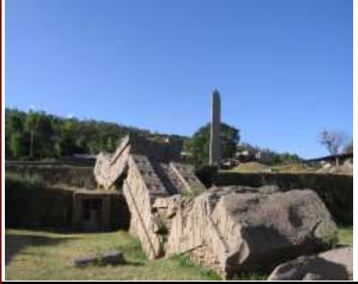
Aksum – Ethiopia