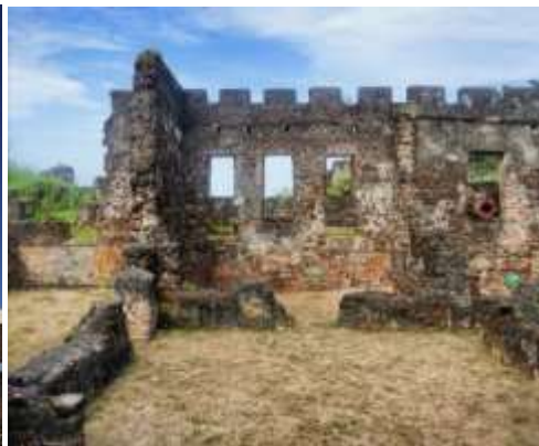
Kunta Kinteh Island and relates Sites – Gambia