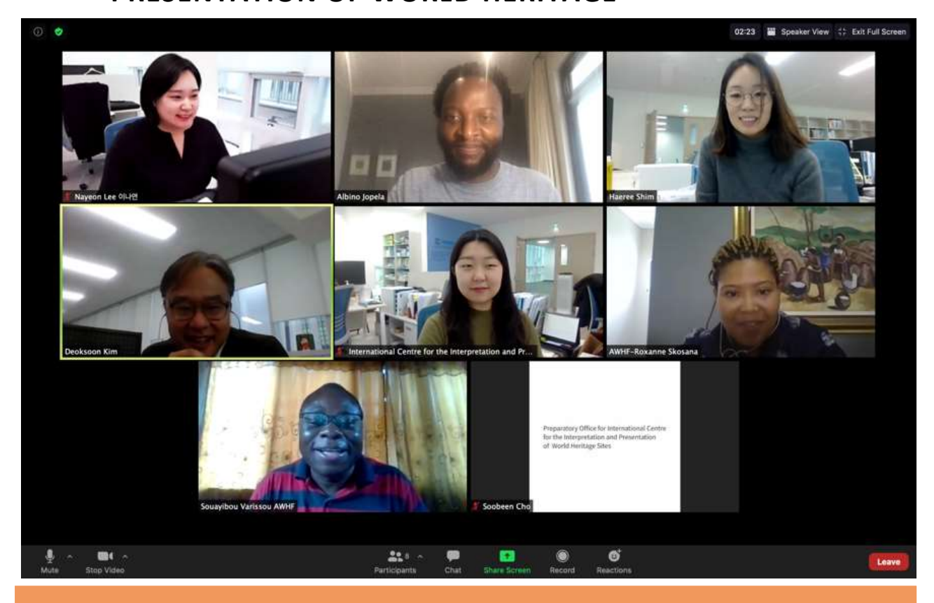
AWHF holding an introductory meeting with the International Centre for Interpretation and Presentation of World Heritage Sites under the auspices of UNESCO (WHIPIC)

The AWHF held an introductory meeting with the Preparatory Office of International Centre for Interpretation and Presentation of World Heritage Sites under the auspices of UNESCO (WHIPIC). WHIPIC is a newly established Category 2 Centre under the auspices of UNESCO in the field of World Heritage, which was approved by the 40th UNESCO General Assembly in 2019. The Centre aims to strengthen the role of interpretation and presentation of World Heritage through its main functions, such as research, education and training, information and network in implementing the 1972 Convention. Chaired by the Executive Director of AWHF, the meeting discussed future cooperation and development of joint projects between the Fund and WHIPIC in the field of interpretation and explanation of World Heritage in Africa. One of the outcomes of the meeting was the AWHF contribution to the "2021 Webinar Series on the Interpretation of World Heritage" hosted by the WHIPIC.