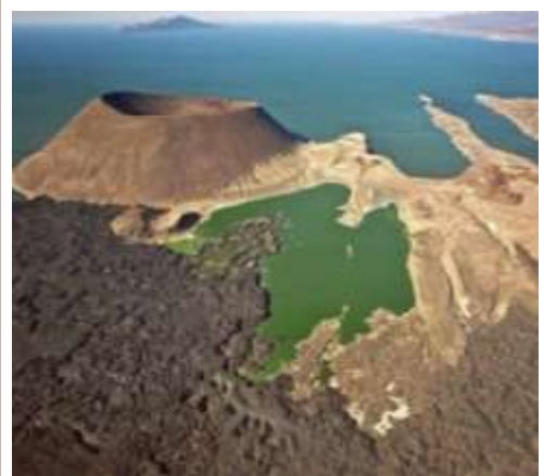
Lake Turkana National Park – Kenya