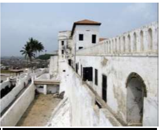
Forts & Castles, Volta, Greater Accra, Central and Western region – Ghana