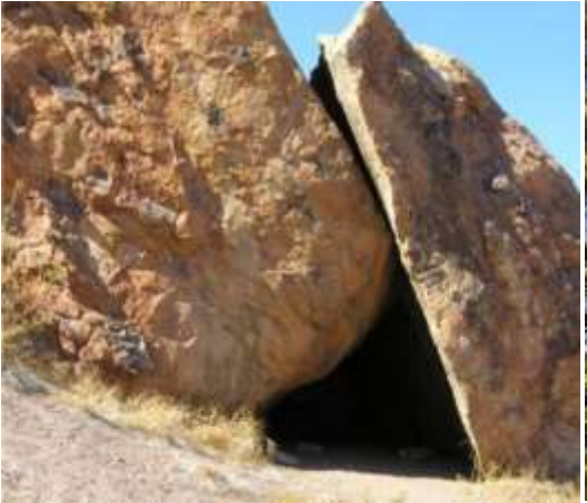
Mapungubwe Cultural Landscape – South Africa