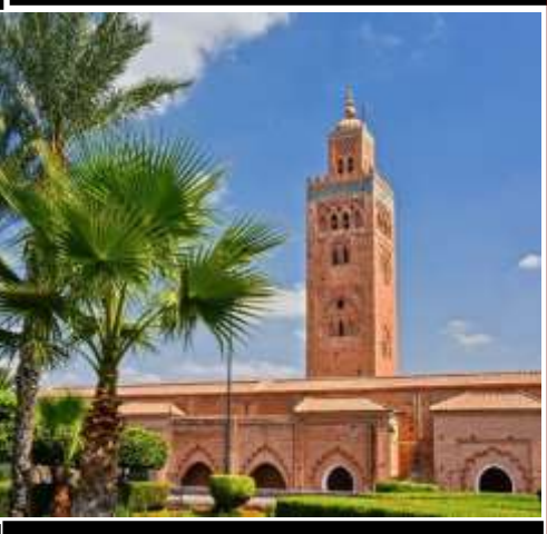
Medina of Marrakesh – Morocco