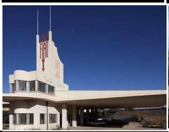
Asmara, A Modernistic African City – Eritrea