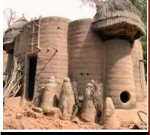
Koutammakou, the land of the Batammariba - Togo