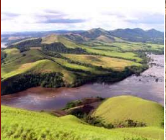
Ecosystem and Relict Cultural Landscape of Lopé-Okanda – Gabon