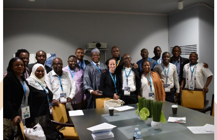
Meeting with African Site Managers @AWHF