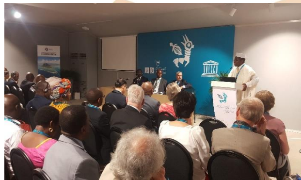
Side Event on “World Heritage and Sustainable Development” in progress