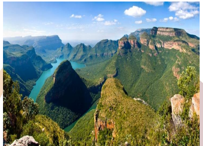
Barberton Makhonjwa Mountains, South Africa