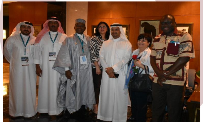
Centre for Arab Region Delegation @AWHF