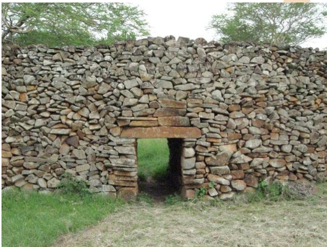
Thimlich Ohinga, Kenya

UNESCO called it "an exceptional example of the tradition of the first pastoral communities in the Lake Victoria Basin".