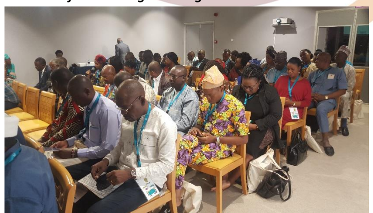
Daily African Delegation Meetings @AWHF