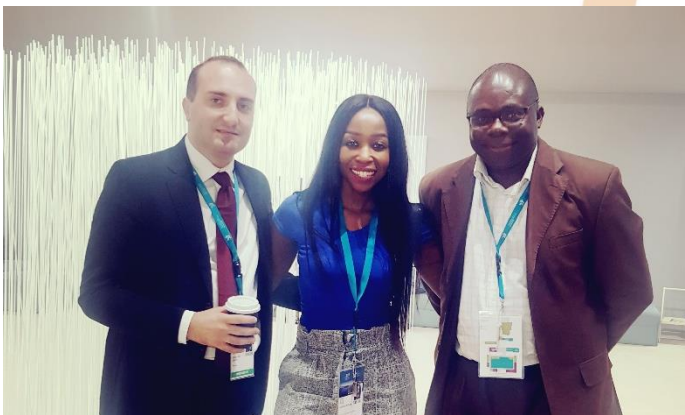
Deputy Minister of Culture, Montenegro @AWHF