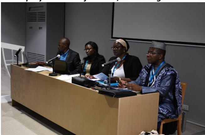
Daily African Delegation Meeting @AWHF