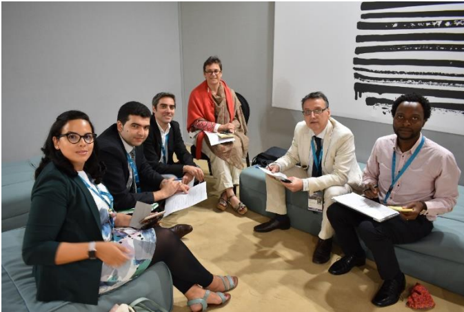
Meeting with C2C Representatives @AWHF

Furthermore, AWHF held meetings with several delegations on issues related to partnerships and to further strengthen relations and growth opportunities for the Fund. The delegations engaged included ICOMS, the Minister of Culture of Cameroon, delegation of Saudi Arabia, Botswana, Arab Centre and Benin. Daily meetings were also held with various African delegations.