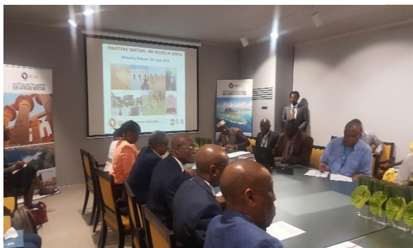
Ministerial Roundtable Meeting on “World Heritage Issues in Africa” in progress