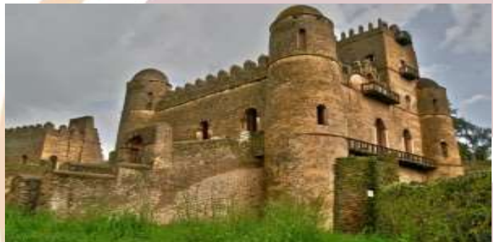
Ethiopia – Fasil Ghebbi