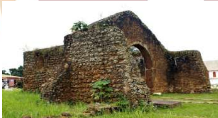
Angola – Mbaza Congo