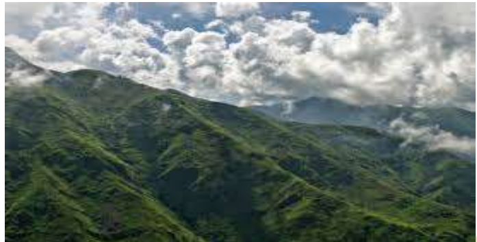
Democratic Republic of Congo - Virunga Mountains