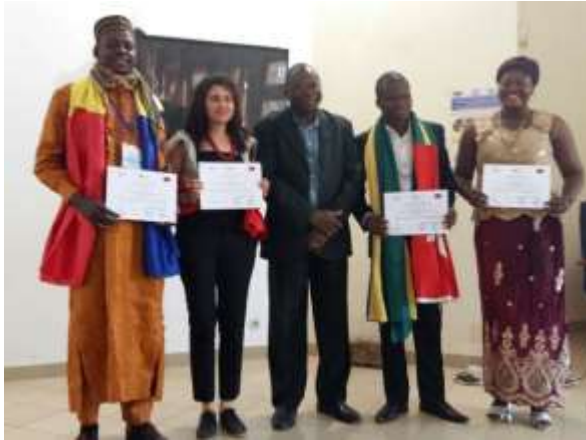
Participants receiving their certificates of participation, awarded by the representative of AWHF