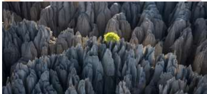
Madagascar - Tsingy de bemaraha strict nature reserve