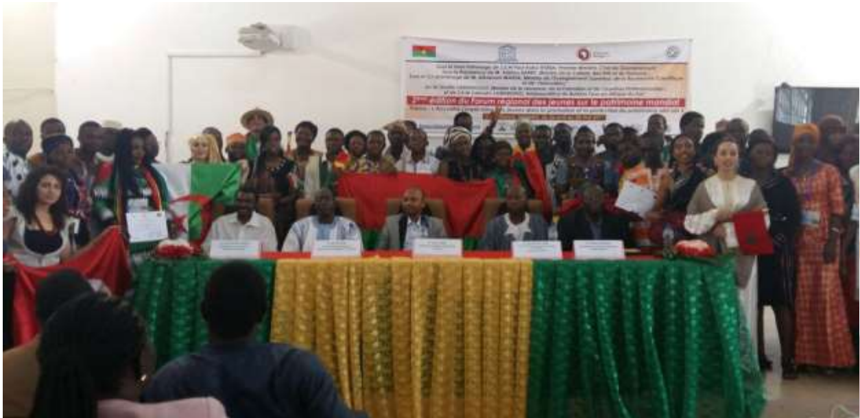
Participants with their certificates gathered with all the dignitaries on the final day of the Forum