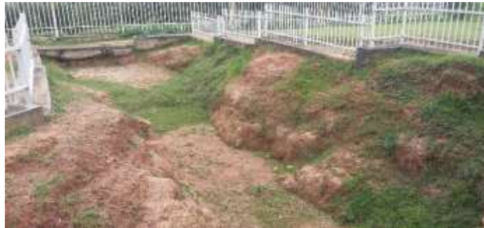
Rwanda – Murambi Genocide memorial Sites