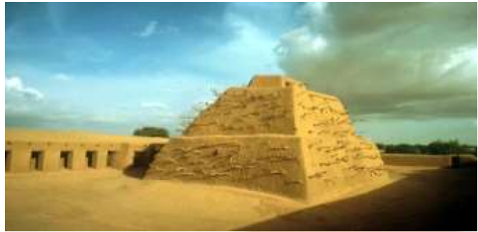
Mali – Tomb of Askia