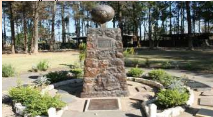
Zambia – Mwela Rock Art National Monument