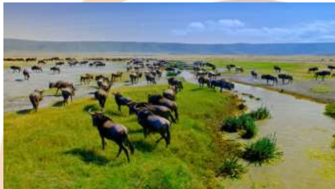
Tanzania – Ngorongoro Conservation Area

Zambia – The 2017 event was graced by the Minister of Tourism and Arts, Hon. Charles Banda who was accompanied by the Provincial Administration led by the Deputy Permanent Secretary and Members of the Board for the National Heritage Conservation Commission and other Senior Government officials.