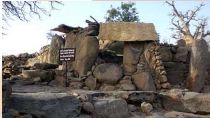
Nigeria – Sukur World Heritage Site