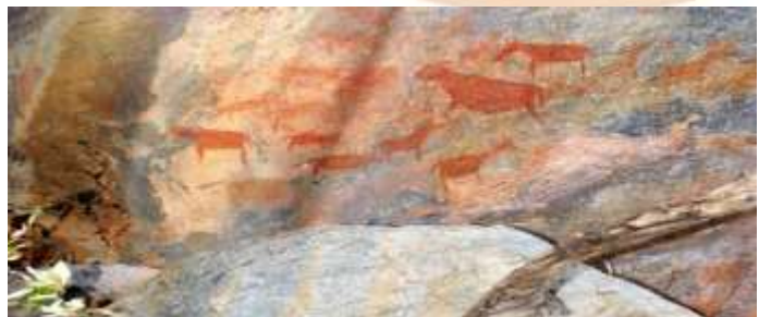
Botswana - Tsodilo