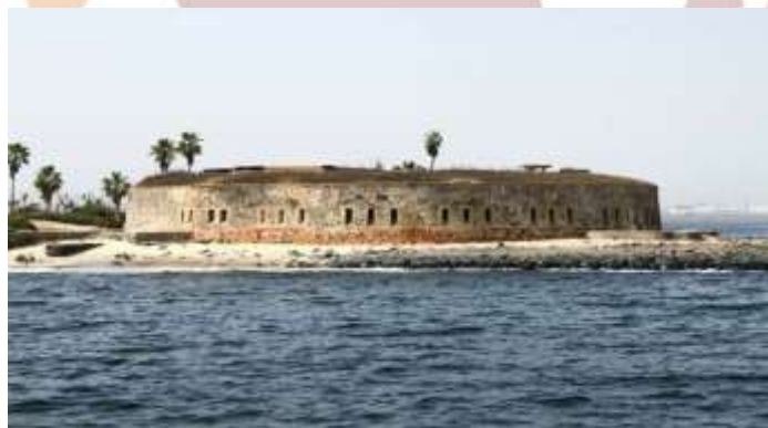
Senegal – Island of Goree