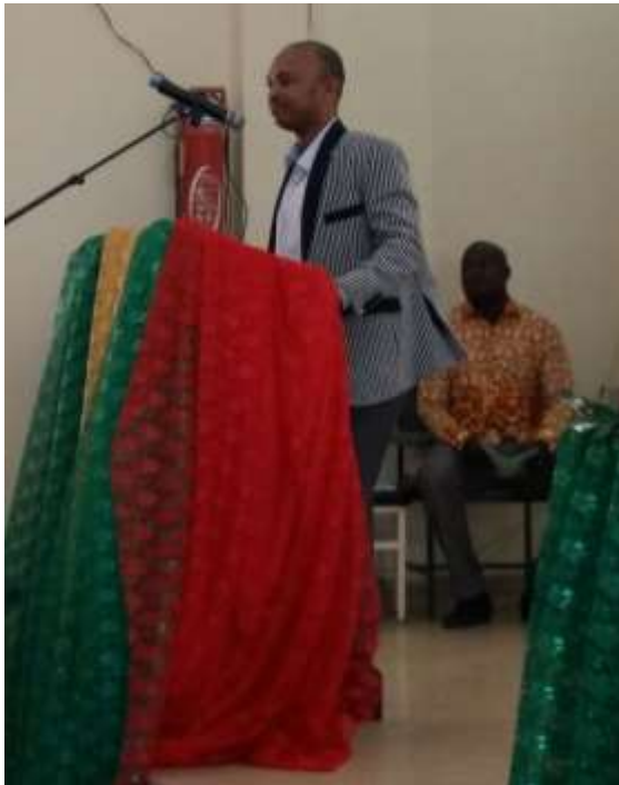
Minister of Culture, Arts and Tourism of Burkina Faso, Mr Tahirou Barry

The Seminar that followed was based on “Protection of African World Heritage: Stakes, Challenges and Perspectives” and was hosted on 4th May in Gaoua. It saw participation from 200 youth, academics, decision makers, regional and local authorities and representative of media. The Seminar was officially opened by Mr. Alkassoum Maiga, Minister of High Education, Scientific Research and Innovation of Burkina Faso. In his address, the Minister advocated for the world cultural and natural heritage to be inserted in the curriculum of the University of Gaoua which will be opened next year. The various presentations and discussions assessed the achievements and challenges that exist when implementing the World Heritage Convention in Burkina Faso and Africa. The closing ceremony of the Seminar was led by Mr. Tahirou Barry, Minister of Culture, Arts and Tourism of Burkina Faso.