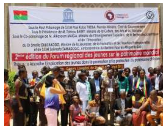
Youth Forum Participants with the officials