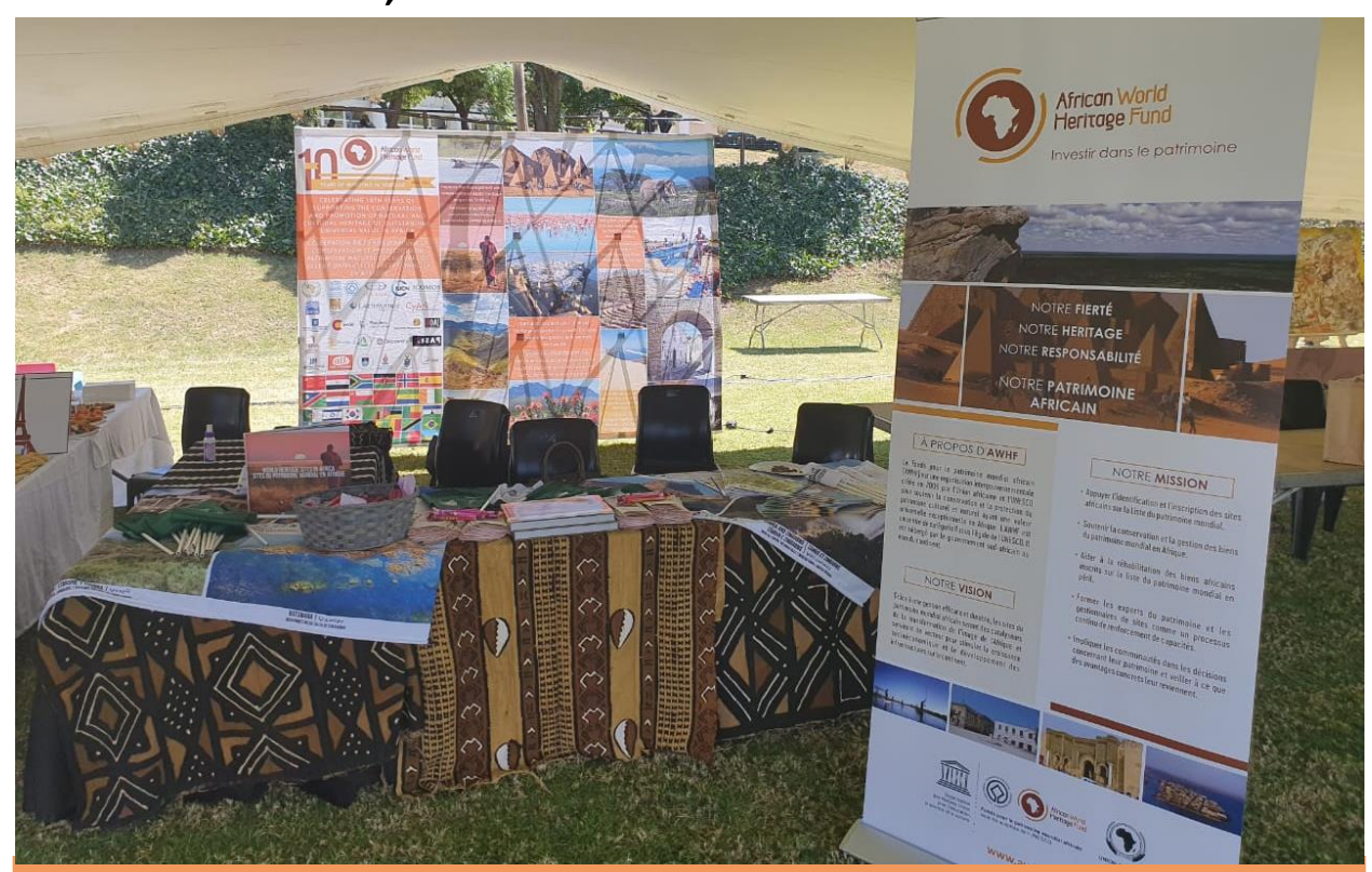
AWHF exhibition set-up at the Francophonie Festival at Crawford High School

The annual Francophonie Festival celebrated its Opening on 7th March 2020 at Crawford School in Pretoria, South Africa. The three week-long diversified event is a platform available to embassies, institutions, Francophones and Francophiles for the promotion of Francophone cultural and linguistic diversity. More than 25 countries were represented, and an array of exhibitions and experiences rooted in the Francophone culture were displayed.