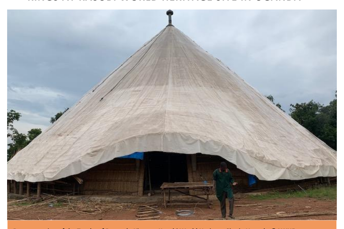
Reconstruction of the Tombs of Buganda Kings at Kasubi World Heritage Site in Uganda