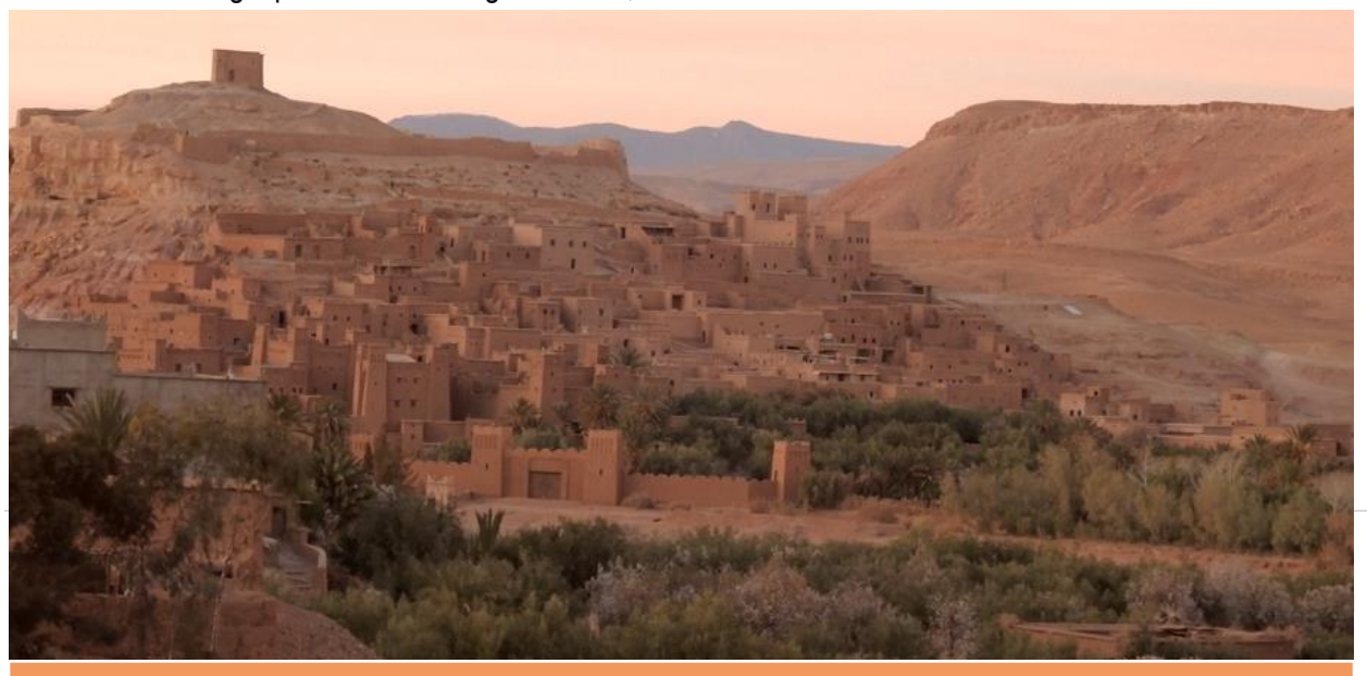
Ksar of Ait-Ben-Haddou World Heritage Site, Morocco

UNESCO World Heritage Centre, and the Advisory Bodies to the World Heritage Convention (ICOMOS, ICCROM and IUCN). The participants also attended the official opening of the exhibition "Heritage of Earthen Architecture in the Arab States" which included several World Heritage Sites in North Africa such as Ancient Thebes with its Necropolis (Egypt), Ksar of Ait-Ben-Haddou (Morroco), M'Zab Valley (Algeria) and Ancient KSOUR of Ouadane, Chinguetti, Tichitt and Oualata (Mauritania).