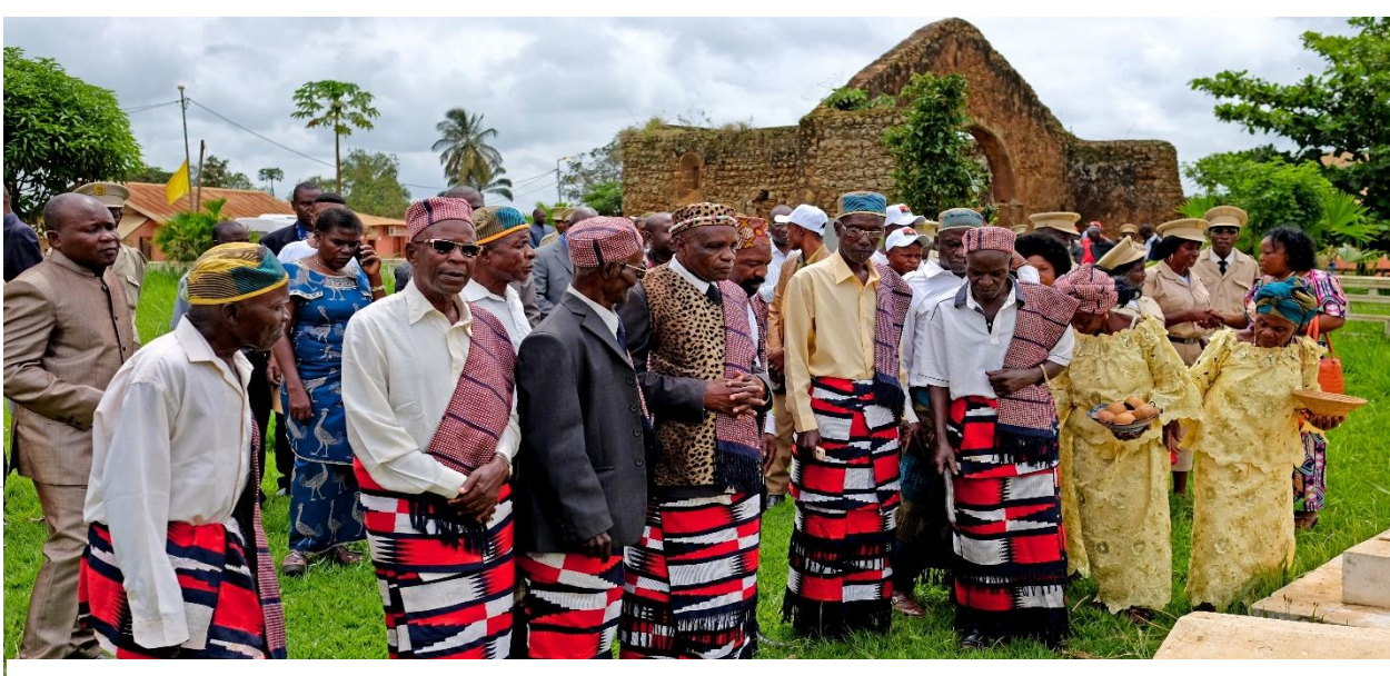
Elders at Mbanza Kongo World Heritage Site in Angola