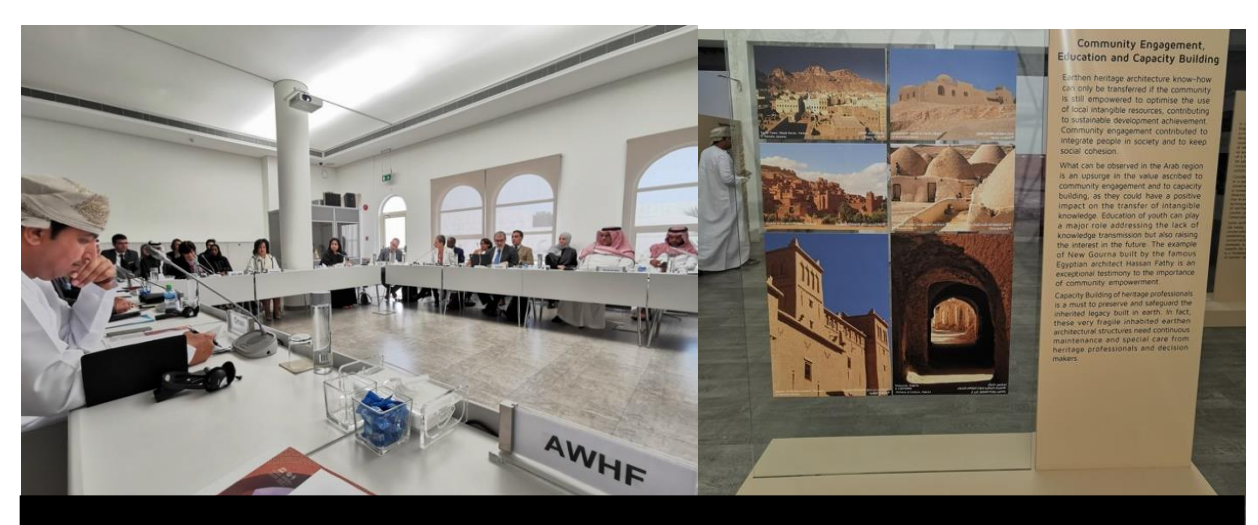
Board meeting in progress (left) & Exhibition on "Heritage of Earthen Architecture in Arab States"

The African World Heritage Fund attended the 9<sup>th</sup> Governing Board Meeting Arab Regional Centre for World Heritage (ARC-WH), a Category 2 Centre under the auspicious of UNESCO. The meeting was held on 17<sup>th</sup> February in Manama, Bahrain, under the leadership of H.E. Shaikha Mai bint Mohammed Al Khalifa , President of Bahrain Authority for Culture and Antiquities and Chairperson of the Governing Board of ARC-WH. The meeting was important to coordinate strategies and collaboration between AWHF and some of its strategic partners including ARC-WH,