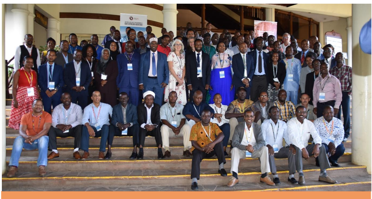
Group photo: Workshop for African World Heritage Site Managers, Nairobi, Kenya

Following the launch of the Third Cycle of Periodic Reporting in the African Region by the World Heritage Committee in July 2019, in Baku, a workshop for African World Heritage Site Managers was held in Nairobi, Kenya, from 19<sup>th</sup> to 21<sup>st</sup> February 2020. The workshop was organised by the World Heritage Centre, UNESCO Regional Office for Eastern Africa and the African World Heritage Fund in partnership with the Government of Kenya through the Ministry of Sports, Culture and Heritage (National Museums of Kenya) and the Ministry of Environment, Water and Natural Resources (Kenya Wildlife Service). Seventy-five (75) participants from 17 State Parties to the World Heritage Convention attended the workshop including Site Managers and representatives of African States Parties, Advisory Bodies (ICOMOS, ICCROM and IUCN), UNESCO representatives from regional and field offices, the Coordination team of the Periodic Reporting, and the authorities and heritage professionals from the host country. The official opening ceremony featured a welcome remark by Ms. Ann Therese Ndong Jatta, Director of UNESCO Regional Office for Eastern Africa and keynote address by Dr Amina Mohamed, the Kenyan Cabinet Secretary, Ministry of Sports Culture and Heritage. The participants renewed their commitment to achieving 100% of completion of Sections II of the Periodic Reporting Questionnaire due to be submitted by States Parties to UNESCO by 31 July 2020.