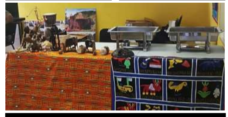
Benin exhibition stand at the Francophone Festival