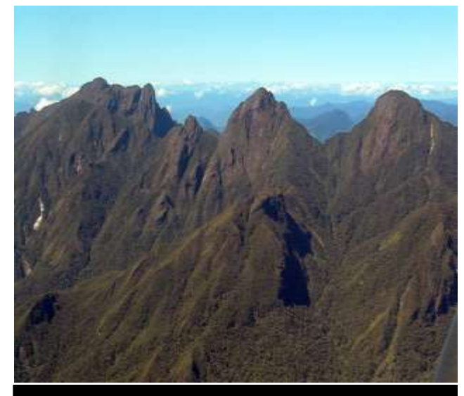
The Rainforests of the Atsinanana in Madagascar

The Rainforests of the Atsinanana comprise six national parks distributed along the eastern part of the island. These relict forests are critically important for maintaining ongoing ecological processes necessary for the survival of Madagascar's unique biodiversity, which reflects the island's geological history. Having completed its separation from all other land masses more than 60 million years ago, Madagascar's plant and animal life evolved in isolation. The rainforests are inscribed for their importance to both ecological and biological processes as well as their biodiversity and the threatened species they support. Many species are rare and threatened especially primates and lemurs.