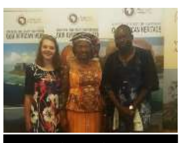
AWHF with H.E. Salamata Sawadogo, the Ambassador of Burkina Faso

The AWHF exhibition "African Heritage under Attack" is currently displayed at the Museum of Africa in Newtown Johannesburg. Twenty four (24) panels are featured, focusing on the dangers that threaten cultural and natural heritage sites in Africa. The exhibition will be displayed until the end of June 2017.