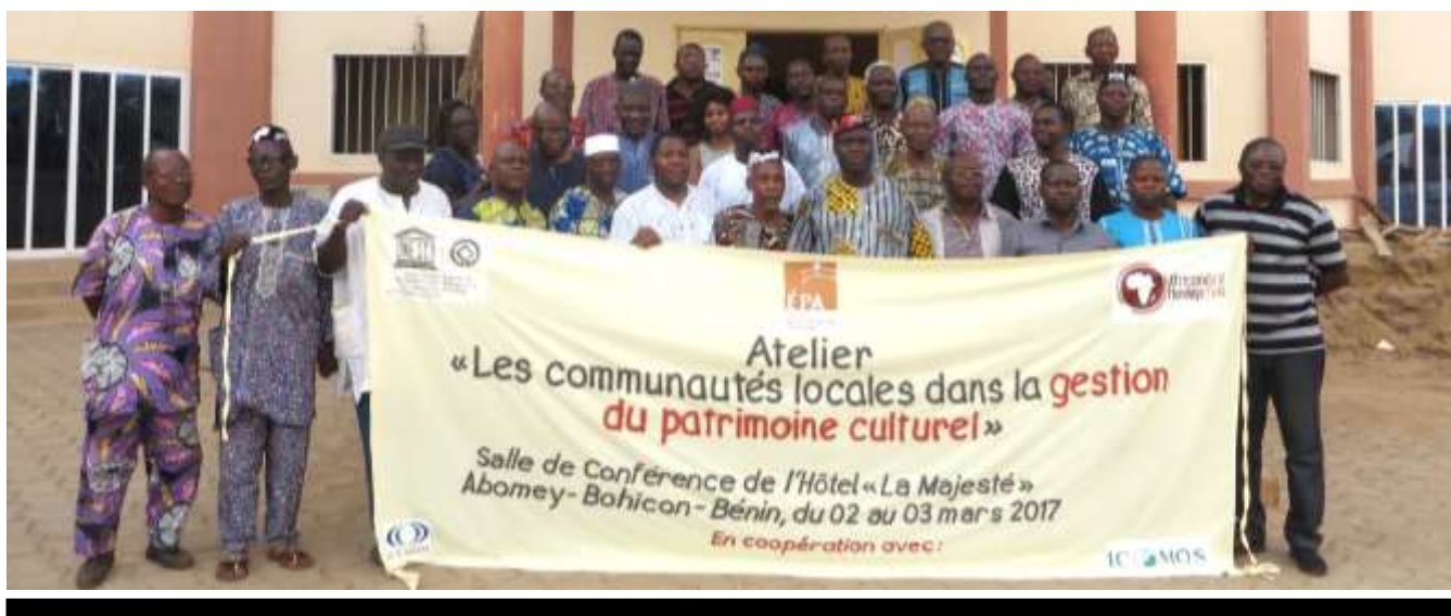
Participants at the expert workshop on local community involvement in Benin

An Expert Workshop, took place from 2 to 3 March 2017 in Benin, and brought together experts from the World Heritage Centre, advisory bodies and African organizations/sites to discuss issues, challenges and obstacles to strengthening the involvement of local communities in the management of World Heritage sites. The workshop was structured in a way to identify few sites for pilot projects. The results of these projects will be examined during an international conference in 2018, which will enable the main thrusts of a new methodology to be implemented on cultural heritage sites in Africa. The workshop was organized by UNESCO World Heritage Centre in partnership with Advisory Bodies, the School of African Heritage (EPA) and AWHF.