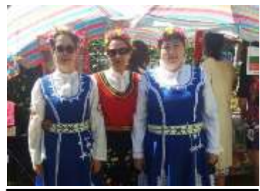
The Bulgarian exhibition stand at the Francophone festival