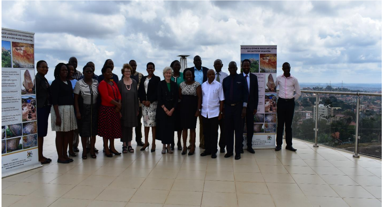
Group Photo: Participants attending the workshop in Kampala, Uganda