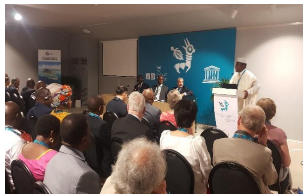
Side Event on "World Heritage and Sustainable Development" in progress