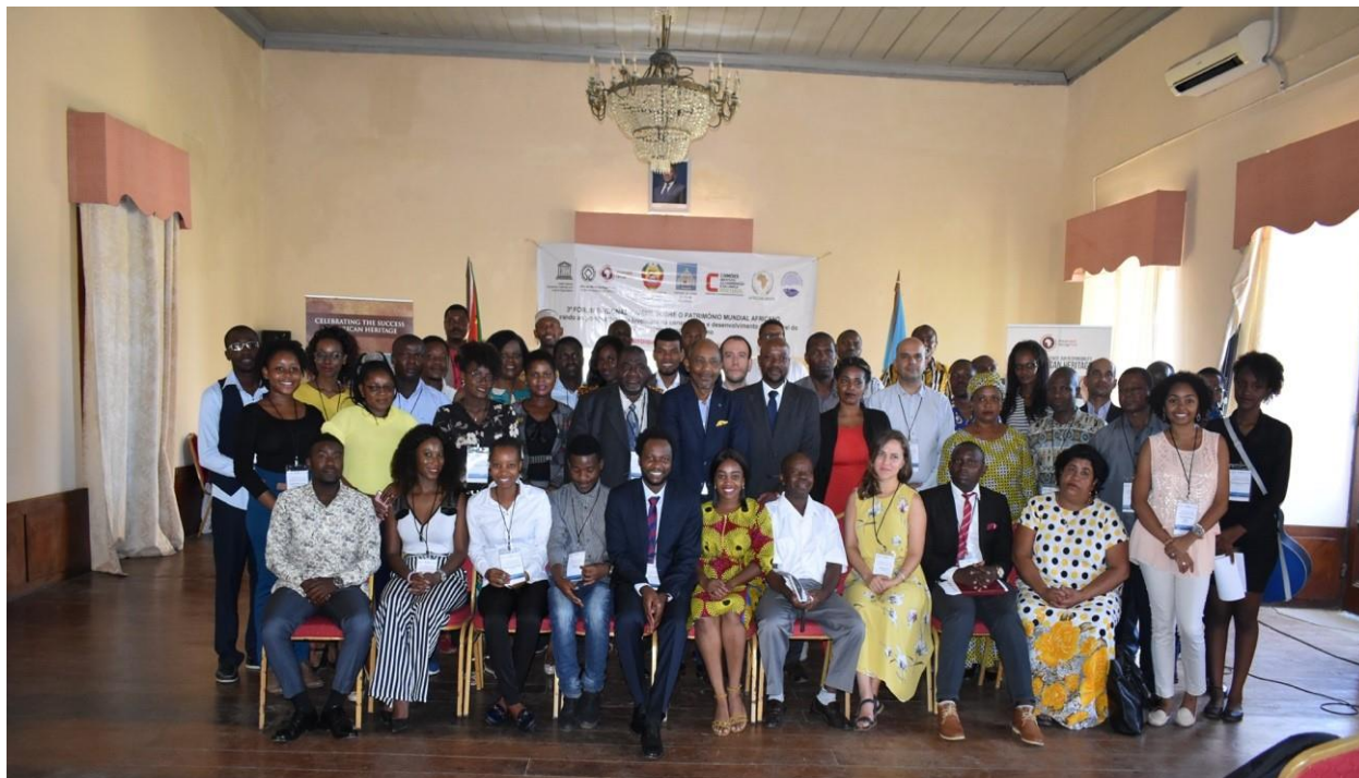
Group photo: Officials and Participants of the Regional Youth Forum in Maputo, Mozambique

The African World Heritage Regional Youth Forum on "Mainstreaming youth perspective and involvement in conservation and sustainable development of African World Heritage" for the Portuguese-speaking countries in Africa gathered 18 young participants from Mozambique, Angola São Tomé e Príncipe, Guiné-Bissau and Namibia. The Forum was jointly organized by AWHF and the Ministry of Culture and Tourism of Mozambique, with the support from UNESCO (World Heritage Centre and Maputo Office), the Portuguese Cooperation in Mozambique, the African Union, the City Council of the Island of Mozambique, Government of the District of the Island of Mozambique and Conservation Cabinet of the Island of Mozambique. The Forum took place in the Island of Mozambique World Heritage Site, between 29th April and 3rd May and aimed at raising awareness and deepening the understanding of the youth regarding issues and threats facing African World Heritage while offering a platform for the youth to harness their creativity, working together and building networks.