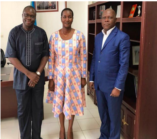
AWHF with Hon Julienne Uwacu, Minister of Sport and Culture, Rwanda