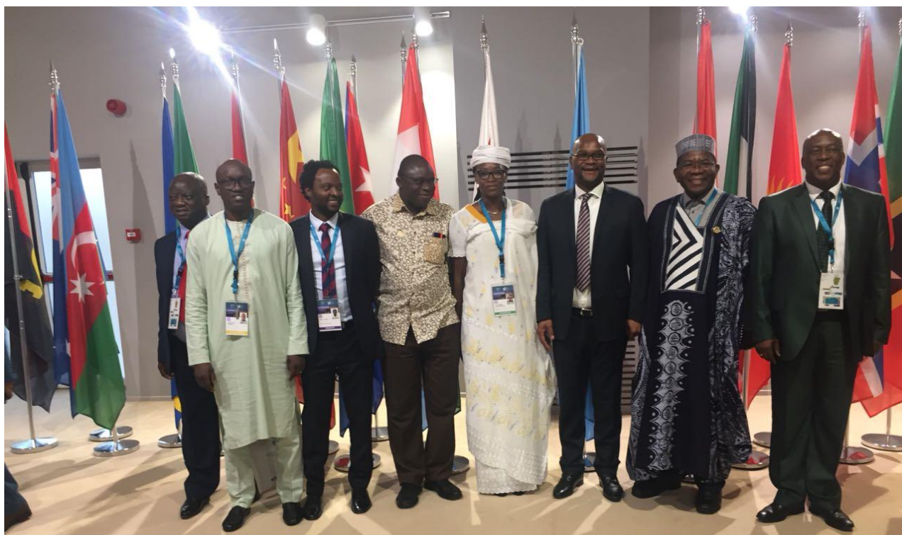
AWHF, South African Government, UNESCO & IUCN at the 42nd World Heritage Committee Meeting in Manama, Bahrain