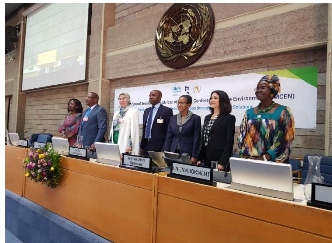
Various African Ministers of Environment attending the 7 th Special Session of AMCEN