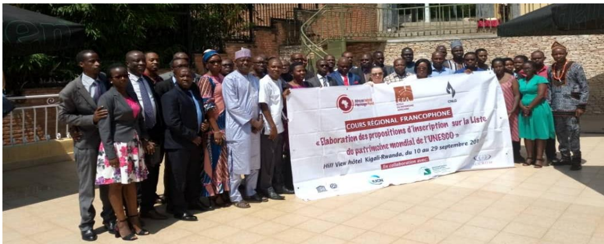
Group photo: Participants from ten (10) French and Portuguese speaking African countries

The AWHF World Heritage Nomination Training Course took place from 09 – 12 September in Kigali, Rwanda. It gathered sixteen (16) participants (including eight (8) observers from Rwanda) from ten (10) French and Portuguese speaking African countries namely: Angola, Benin, Burkina Faso, Cameroon, Chad, Cote d'Ivoire, Guinea, Niger and Rwanda. The participants gathered were working on nine (9) nomination projects. The course was aimed at strengthening the skills of African heritage practitioners to develop successful World Heritage nomination dossiers.