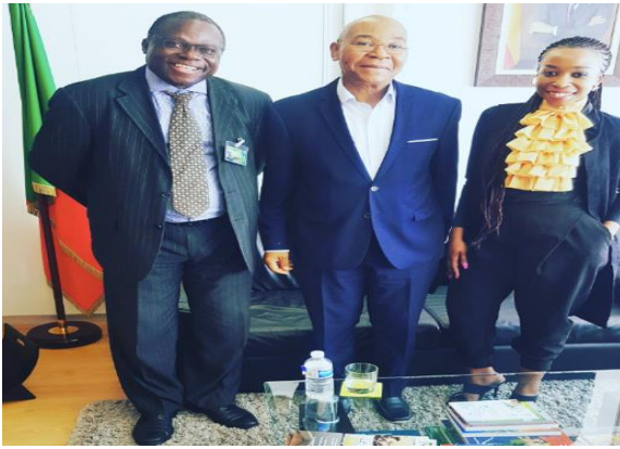
AWHF with Ambassador – Permanent Delegate of Benin to UNESCO

AWHF had engagements with Ambassador - Permanent Delegate of Benin to UNESCO on future collaboration prospects with the Fund.