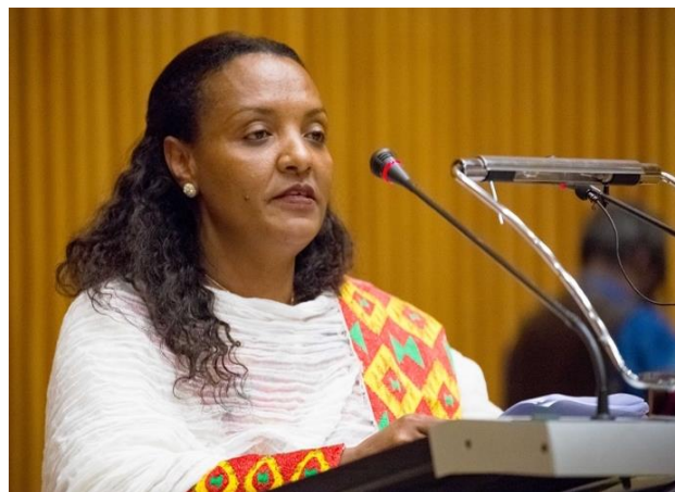
State Minister of Culture and Tourism of Ethiopia, Honorable Mrs. Bezunesh Meseret @AWHF

AWHF presented on the outcome of the youth forums held in South Africa (Anglophone - 2016), Burkina Faso (Francophone - 2017) and Mozambique (Lusophone - 2018). The Presentation focused on youth involvement in the heritage sector in Africa and capacity building. The Fund was requested to assist in the implementation of the African Union (AU) Agenda 2063. The AU Agenda 2063 is a strategic framework for the socio economic transformation of the continent over the next fifty years. Aspiration five (5) speaks to the objective of PACC5, which is to have an Africa with a strong cultural identity, common heritage, values and ethics.