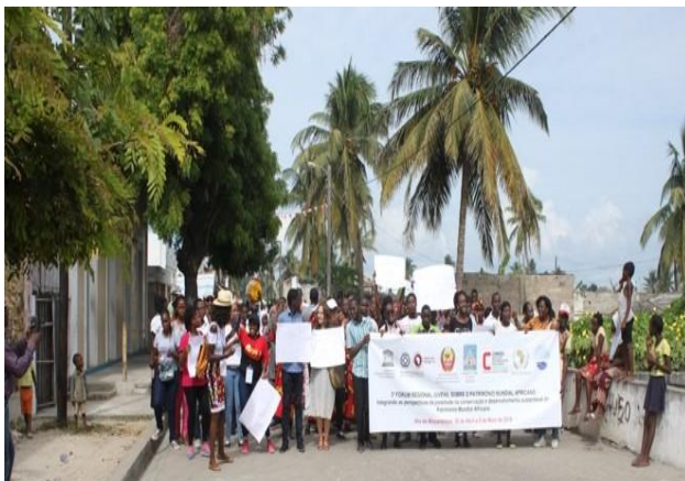
A 'heritage walk' through the Island of Mozambique attended by more than 200 people @AWHF