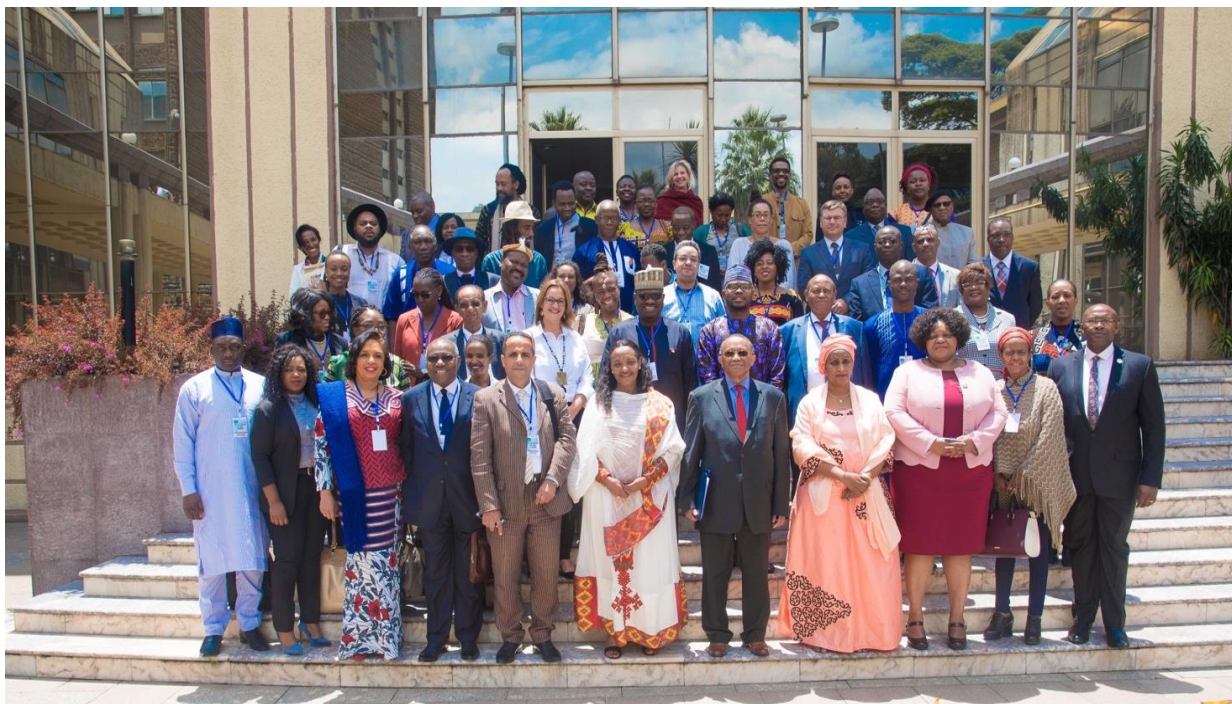
Group Photo: Officials and Participants attending the 5 th Pan African Cultural Congress (PACC5) in Addis Ababa, Ethiopia

The Pan African Cultural Congress was held in Addis Ababa Ethiopia from the 5th to 7th September 2018. The theme was “Advancing the Africa Union Agenda 2063 through Culture and the African Creative Economy”. The congress was attended by the State Minister of Culture and Tourism of Ethiopia Honorable Mrs. Bezunesh Meseret.