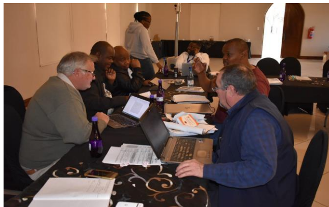
Group discussion during the workshop

AWHF's role was to assist with the development of a Disaster Risk Management Plan framework for South Africa, which aligns with the Fund's strategic objective of increasing and strengthening human resource capability and capacity for training institutions on the protection, conservation and management of cultural and natural heritage.