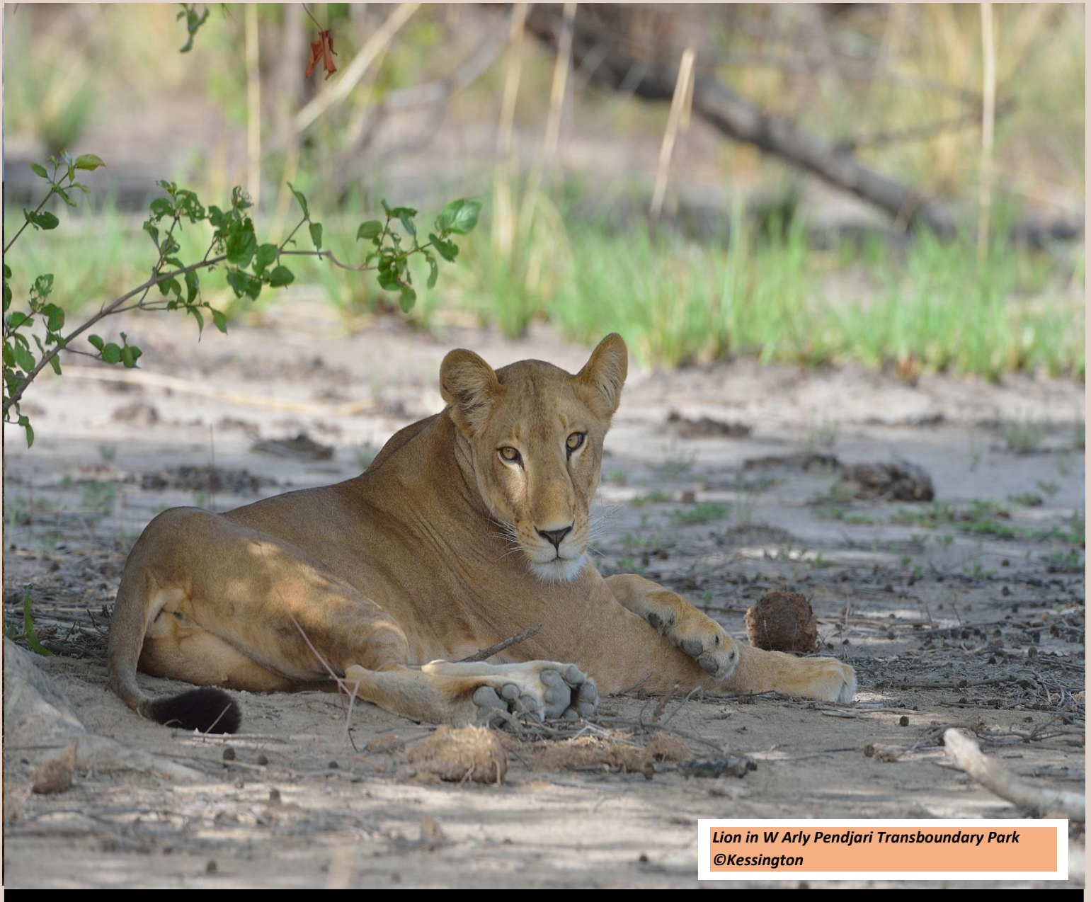
Lion in W Arly Pendjari Transboundary Park