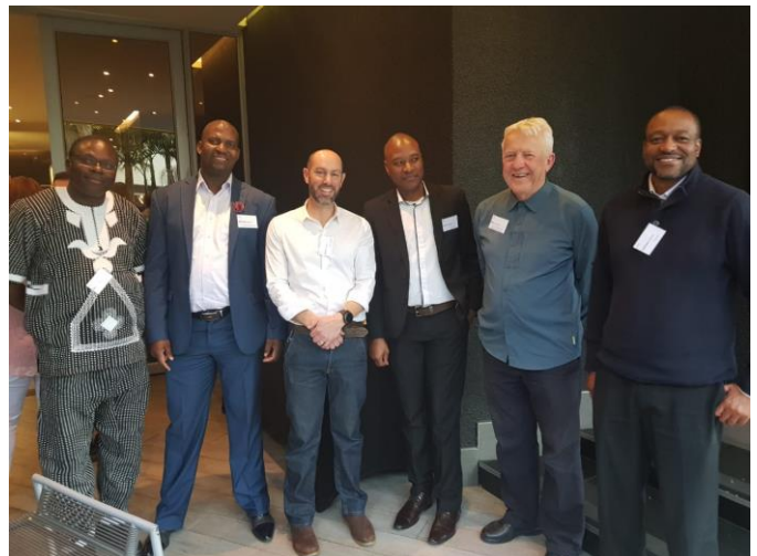
AWHF with ABCCSA in Sandton, South Africa

AWHF engaged with the Australian Business Chamber of Commerce Southern Africa (ABCCSA) on possible areas of cooperation and partnership.