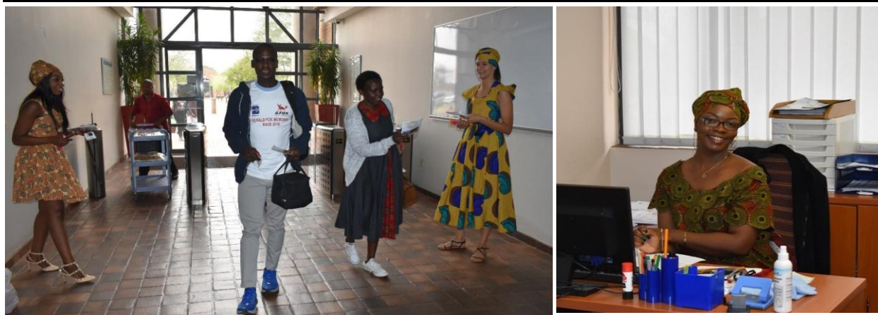
AWHF creating awareness on the importance of preserving and conserving our rich African Heritage