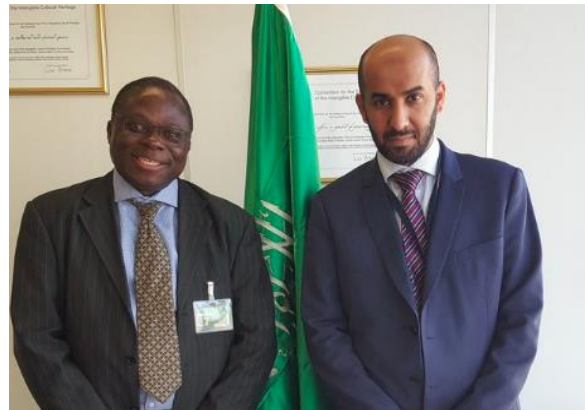
AWHF with Permanent Delegate of Saudi Arabia to UNESCO, Mr. Mohammed Alsemiran

AWHF meets with Councillor of Heritage & Tourism, Mr. Mohammed Alsemiran of the Permanent Delegation of Saudi Arabia to UNESCO. Engagements were on possible bilateral collaborations in areas of capacity building.