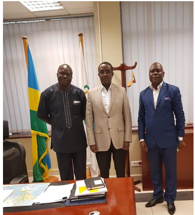
AWHF with Hon. Dr Vincent Biruta, Minister of Environment, Rwanda