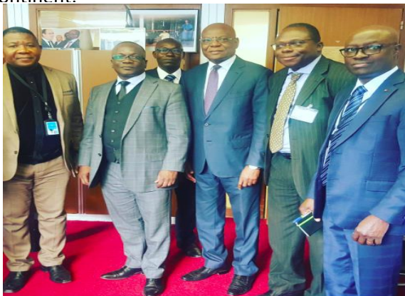
AWHF with the Africa Group

AWHF held a very progressive meeting with the Africa Group on pertinent documents geared to move the objectives of the Fund forward and improve the heritage standing of the African continent.