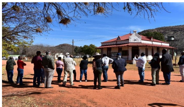
Field work done during the process of the workshop @AWHF