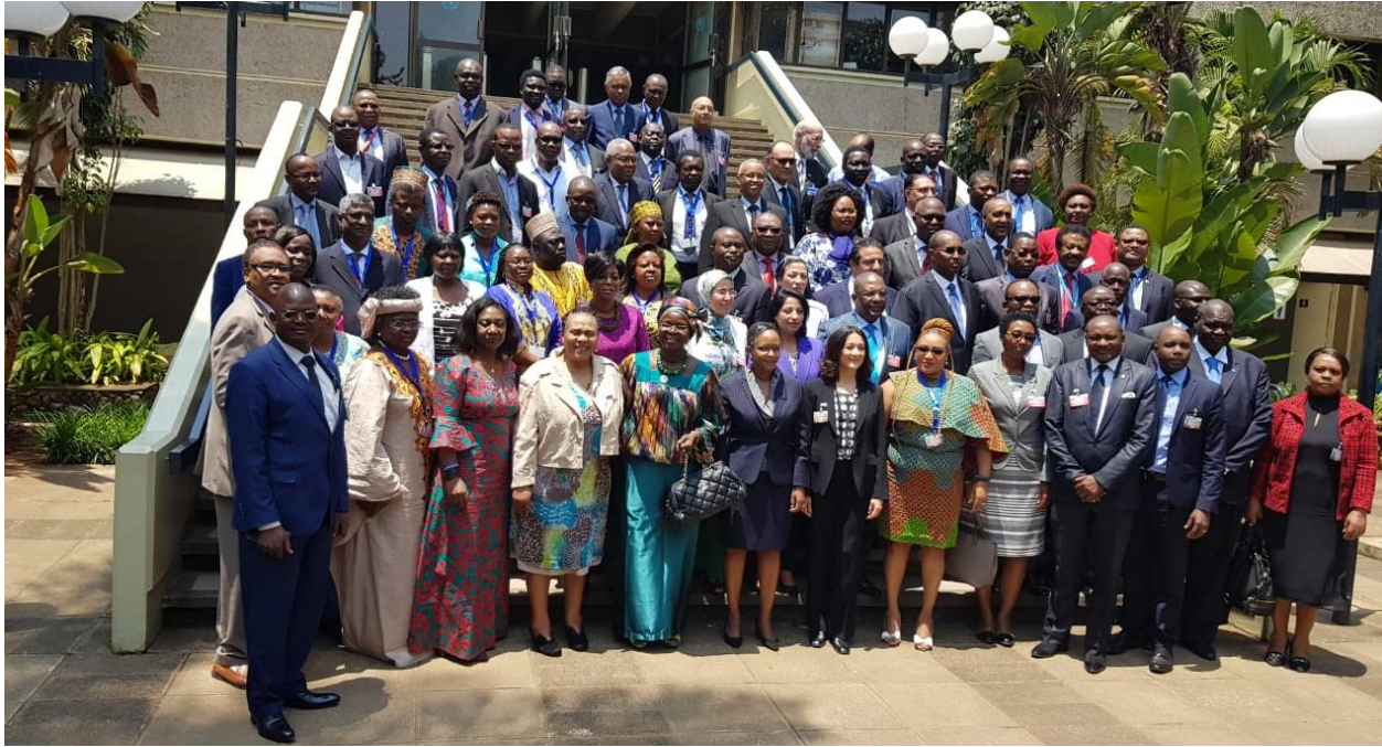
Group photo: Participants from ten (10) French and Portuguese speaking African countries

The 7th Special Session of AMCEN (17-19 September) was organised on the theme "Turning Environmental Policies into Action through Innovative Solutions" jointly with the New Partnership for Africa's Development (NEPAD) Planning and Coordination Agency. The first meeting of the Africa Environment Partnership Platform (20-21 September) was aimed at promoting sustainable environmental management in Africa through enhanced partnership, coordination and harmonization of activities. As per the Decision of the Board of Trustees (at its 23rd Session) and in conjunction with the Department of Environmental Affairs (DEA, South Africa) who provided the required facilitation, AWHF attended the AMCEN for the first time with as objective to: