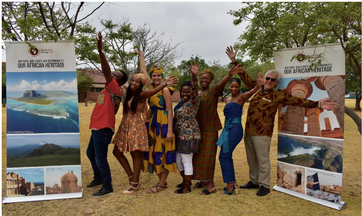
AWHF staff celebrating the South African Annual National Heritage Day

The awareness activation was comprised with handing out awareness communication material to all employees of DBSA. The material provided comprehensive information about the work of AWHF.