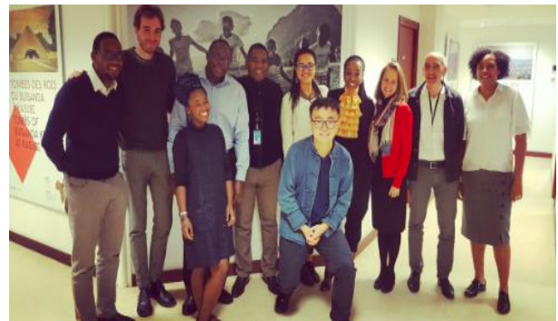
AWHF with the dynamic UNESCO Africa Unit Team in Paris

AWHF held a progressive planning meeting with the UNESCO Africa Unit team in Paris on prospects and programmes for 2019 and beyond.