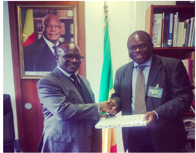
AWHF with Ambassador – Permanent Delegate of Mali to UNESCO

AWHF Acting Executive Director shared a comprehensive publication of African World Heritage Sites with Ambassador – Permanent Delegate of Mali to UNESCO.