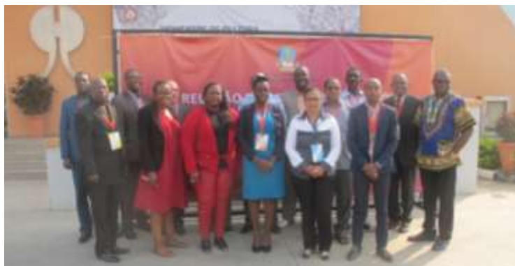
Pictures of the African World Heritage Meeting in Angola