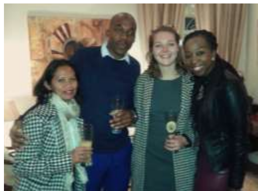
AWHF staff at the decoration ceremony in honour of Dr. Webber Ndoro

African World Heritage Fund, 1258 Lever road, Headway Hill, Midrand 1685, South Africa- www.awhf.net