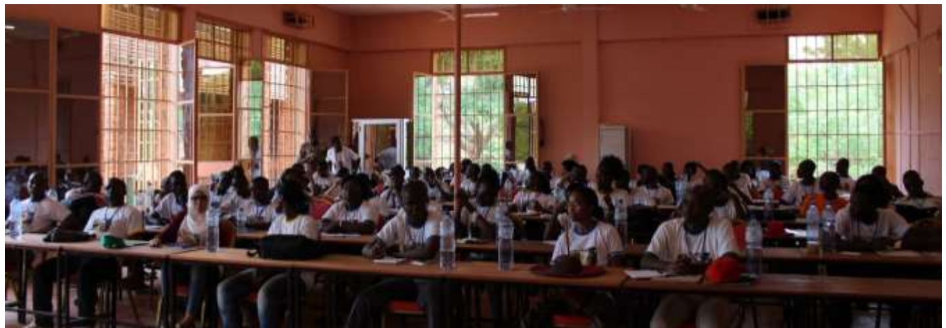
Participants at the Seminar during Regional Youth Forum in Burkina Faso

The Seminar was based on “Protection of African World Heritage: Stakes, Challenges and Perspectives”. It witnessed participation from 200 youth, academics, decision makers, regional and local authorities and representatives of media. The Seminar was opened by Mr. Alkassoum Maiga, Minister of High Education, Scientific Research and Innovation of Burkina Faso. In his address, the Minister advocated for the world cultural and natural heritage to be included in the curriculum of the University of Gaoua which will officially be functional next year. The various presentations and discussions delivered assessed the achievements and challenges that exist when implementing the World Heritage Convention in Burkina Faso and Africa.