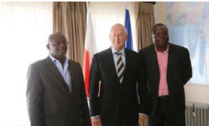
Meeting with H.E. Mr. Andrzej Kanthaka

As a build up to the 41st World Heritage Committee meeting (WHC) in Krakow, Poland, AWHF engaged with the Ambassador of Poland in South Africa, H.E. Mr. Andrzej Kanthaka for the facilitation of the AWHF Side Event. Regularly, during the WHC meeting, the Africa Unit at the World Heritage Centre (WHC) and the African World Heritage Fund (AWHF) have partnered to organize a side event aiming at raising awareness on specific topics related to the implementation of the World Heritage Convention in Africa. A similar initiative was envisioned for the 41st World Heritage Committee meeting in Krakow, Poland.