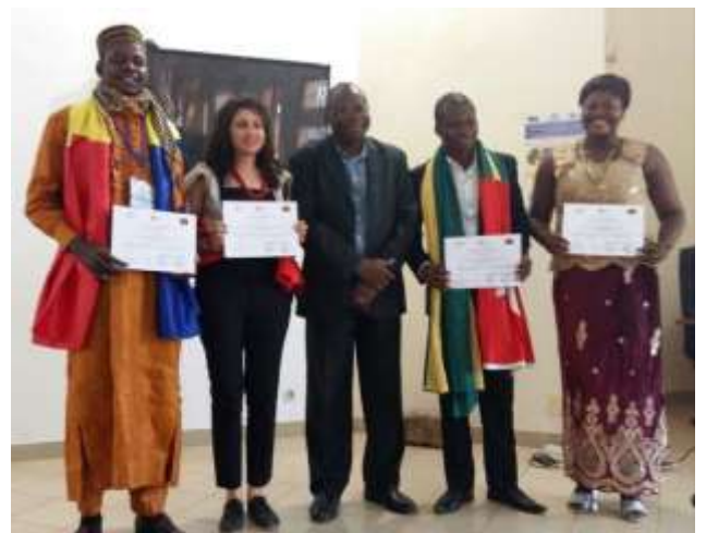
Participants at the end of the Regional Youth Forum in Burkina Faso