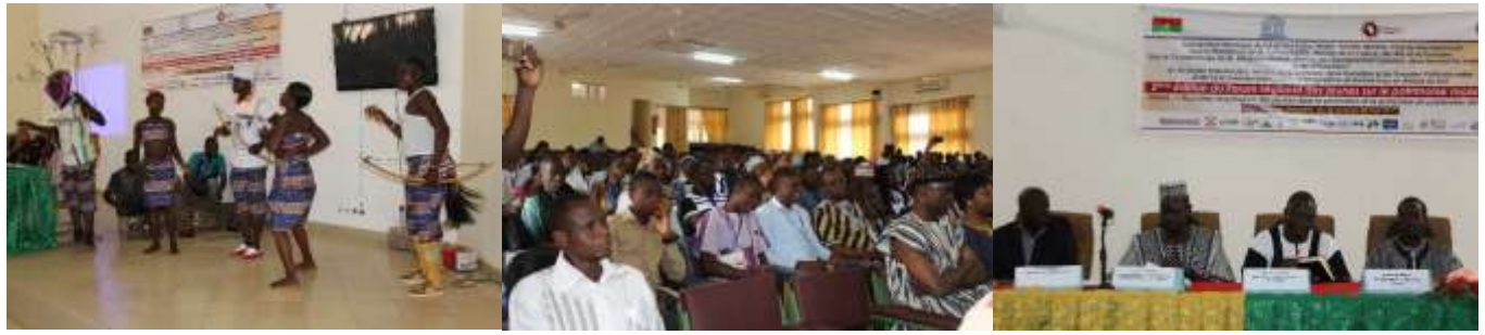
Participants at the Seminar during the Regional Youth Forum in Burkina Faso