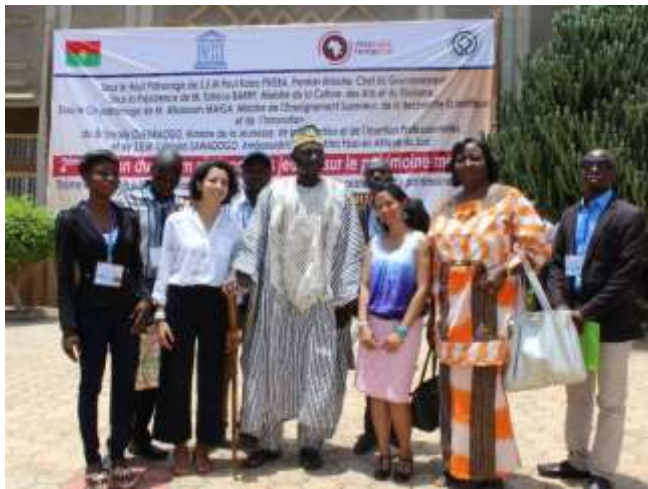
Participants arriving at the Regional Youth Forum in Burkina Faso