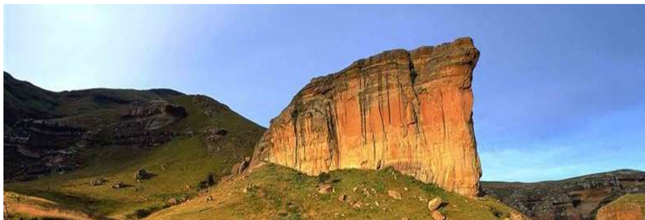
Participants of the board meeting visit Golden Gate National Park and Basotho Cultural Village