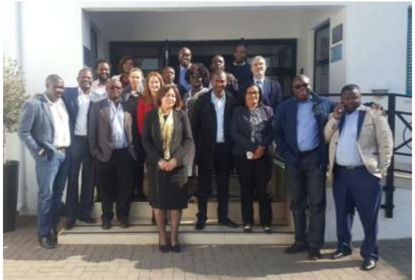
Participants during the Evaluation Meeting in Midrand

The African World Heritage Fund (AWHF) launched the nomination training programme in 2008. The programme is in line with the objectives of the AWHF of contributing to the implementation of the World Heritage Convention in Africa, and in particular, increasing the number of inscribed African properties as part of addressing the imbalance and inequalities identified by the Global Strategy. AWHF developed a new Four Year (September 2016 - February 2020) Upstream Support Programme for Africa. The aim of this programme is to strengthen the capacities of African heritage practitioners in order to develop credible and quality nomination files. The Centre for Heritage Development in Africa (CHDA) coordinates the activities in English speaking countries, while the Ecole du Patrimoine Africain (EPA) coordinates the activities for French and Portuguese speaking countries. The programme is run with the partnership of the African World Heritage Fund (AWHF), World Heritage Centre (WHC), International Union for the Conservation of Nature (IUCN), International Council of Monuments and Sites (ICOMOS), International Centre for the Study of the Preservation and Restoration of Cultural Property (ICCROM) and African States Parties.