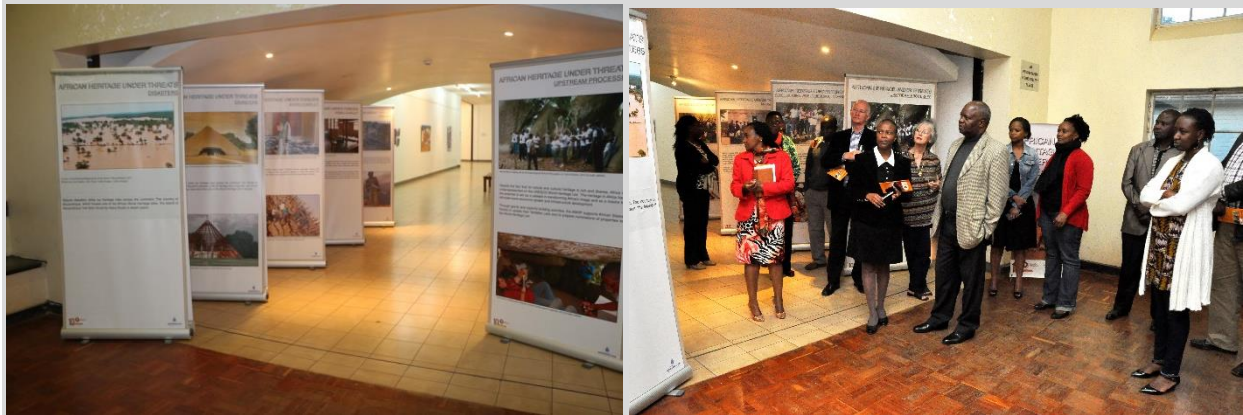
Display and launching of the “African Heritage under Threats” exhibition at National Museum of Kenya

“ African Heritage under Attack ” is a travelling exhibition showcasing some of the most common threats to heritage sites in Africa, e.g. fire, floods, armed conflicts and mismanagement. Launched in May 2015 at the AWHF’s headquarters in South Africa during an event to the private sector, the exhibition travelled in various places in Gauteng province: Witwatersrand University, Museum Africa, and South African Hominids World Heritage Sites at Maropeng. The 24 panels’ exhibition was displayed at Vottrekker Monument in Pretoria during this reporting period.