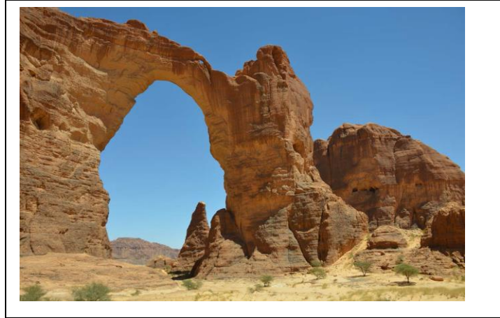
Aloba Arch - © IUCN Guy Debonnet

The sandstone Ennedi Massif has been sculpted over time by water and wind erosion into a plateau that presents a spectacular landscape. Thousands of images have been painted and carved into the rock surface of caves, canyons and shelters, presenting one of the largest ensembles of rock art in the Sahara.