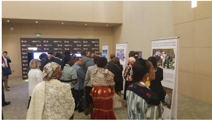
Below. VIPs at the exhibition launch. From Left to Right : Ambassadors of Kenya & Tanzania, Mayor of Istanbul, Minister of Arts and Culture of Cameroon, Chairperson of the 40th Session of the World Heritage Committee, DG of UNESCO, Ambassador of Cote d’Ivoire, Chairperson of UNESCO General Conference and Deputy Permanent Delegate of Burkina Faso to UNESCO

As part of the events during the 40th World Heritage Committee Meeting, the AWHF displayed a photographic exhibition on “ African Heritage under Threats ” alongside a digital exhibition by UNESCO on “ African World Heritage: a pathway for development ” from 10 to 14 July. Both exhibitions were launched on 10 July immediately after the official opening ceremony of the World Heritage Committee Meeting. More than 250 guests and delegates attended the launching ceremony. We thank the Metropolitan Municipality of Istanbul for the support provided to the printing of the exhibition.