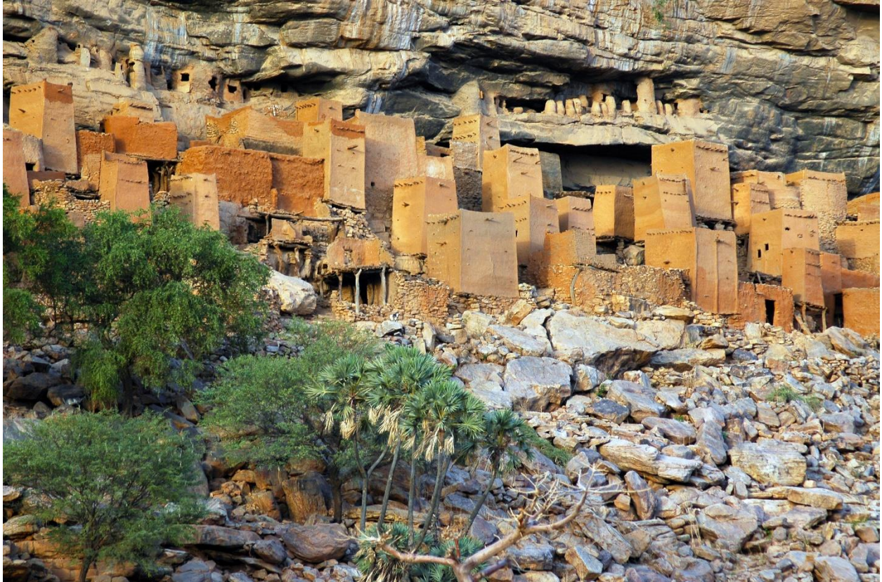
Cliff of Bandiagara (land of the Dogons), Mali