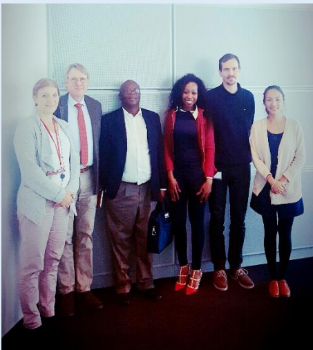
AWHF with GIZ Foundation Team

AWHF embarked on a mission to Eschborn, Germany GIZ Foundation Headquarters with the intention to discuss new partnerships and find areas of cooperation including understanding GIZ projects in the various regions on the African continent. Through this partnership, GIZ would form part of assisting AWHF in achieving our strategic objective for 2016-2019.