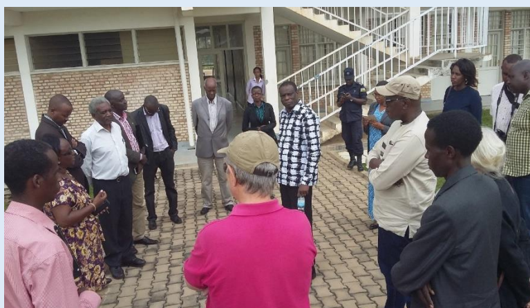
Site visit by experts - courtesy visit by Vice Mayor of Murambi

The expert workshop on the Outstanding Universal Value (OUV) of the memorial sites of Nyamata, Murambi, Gisozi and Biserero, Sites of Genocide against Tutsi in Rwanda in 1994, was organized in Kigali, Rwanda on 7-9 November 2016 by the National Commission for the Fight against Genocide and its local partners (universities, civil society), the UNESCO World Heritage Centre, ICOMOS and the AWHF. The workshop discussed mainly the potential and possibility of developing a nomination dossier for the genocide related sites in Rwanda. The AWHF brought to the workshop African experts from Mali, Senegal and South Africa.