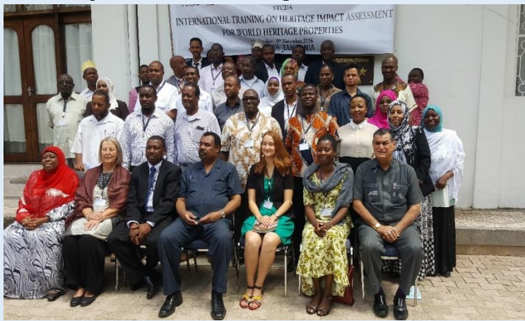
Group of participants at the Heritage Impact Assessment Training

Impact assessment has been a tool used widely in evaluating impacts by other sectors and overtime this has been adapted to suit the heritage sector.