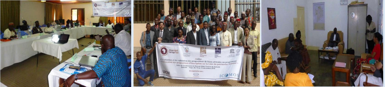
Group photo of participants and presentation during the workshop

The workshop coordinated by the School of African Heritage was held in Sokode, Togo, from 14 to 16 December 2016. It followed a survey on National Tentative Lists in French and Portuguese speaking African countries aiming at identifying the most credible sites to involve in the World Heritage nomination process. The workshop gathered national directors from 11 countries (Angola, Benin, Cameroon, Central African Republic, Chad, Congo, Cote d'Ivoire, Guinea, Mali, Niger and Togo) and experts from UNESCO, ICOMOS, IUCN and AWHF. The experts discussed the criteria requirement including potential Outstanding Universal Values of the sites were identified. Further work includes refining priority sites/themes and supporting the national authorities to develop credible nomination dossiers.