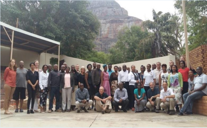
Group photo of participants at the workshop

The South African Department of Environmental Affairs (DEA) in collaboration with the African World Heritage Fund (AWHF) organized a regional workshop from 18 th to 20 th October 2016 at the Swadini Forever Resort in Hoedspruit, South Africa. The workshop gathered 35 participants including experts, World Heritage site managers and policy makers from around Africa to assess the effectiveness of current buffer zone management mechanisms in line with the long term conservation and protection of World Heritage properties. It was also done to reflect on a more efficient and inclusive framework for improved buffer zone management on the African continent. The ultimate goal was to create a set of guidelines