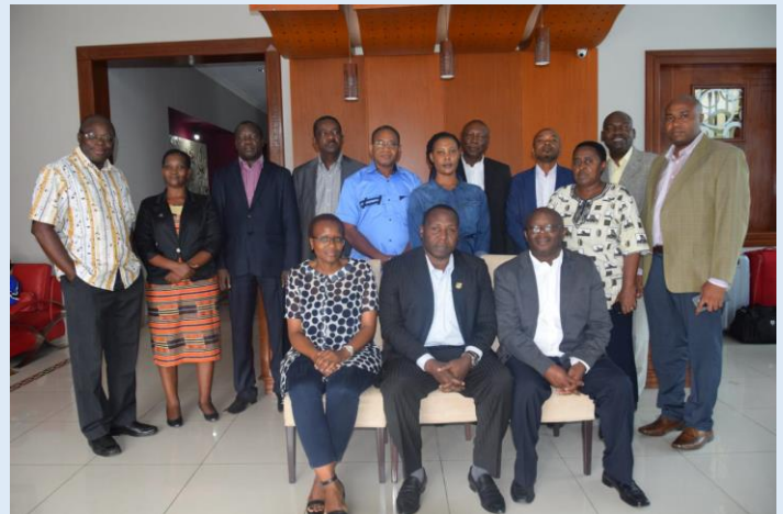
Group photo of attending participants to the meeting

The purpose of the meeting was to prepare the agenda items that were not discussed during the 40th Session of the World Heritage Committee Meeting in July 2016 Istanbul, Turkey and was tabled during the continuation session in October 2016 in Paris, France. The rationale was to provide a platform to World Heritage experts to understand and champion various heritage related issues.