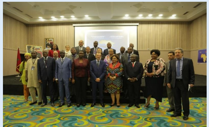
Ministerial representation from Africa & Members of the AWHF Board of Trustees

AWHF concluded the series of events celebrating the 10 th Anniversary on 7 th - 8 th December in Marrakech, Morocco. The event followed immediately after the 20 th Board meeting and gathered more than 150 guests which included Ministers (Angola, Gabon, Morocco, Rwanda), Government Officials (Burkina Faso, Cape Verde, Senegal, South Africa, Tanzania), representative of Private Sector and international organizations (ICCROM, GIZ) and Board of Trustees members under the theme, MARRAKECH 2016: Private sector engagement in the preservation of African Heritage . After an engaging workshop, the participants showed their commitment to AWHF through pledges amounting to $270,000 USD. Pledges for long term support were also noted from Ministers, UNESCO and the African Union. AWHF awarded His Majesty the King Mohammed VI and the Minister of Culture of Morocco for their outstanding contribution to the conservation and promotion of Africa's heritage. The programme concluded with a tour of the magnificent Marrakech, city, inscribed on both the World Heritage tangible and intangible List. We extend our gratitude to the Government of Morocco, the African Governments and Private Sector for supporting the implementation of the World Heritage Convention in Africa. Among the supporting private sector companies were the General Confederation of Enterprises in Morocco and AVIS Budget South Africa.