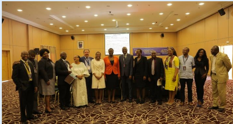
Members of the AWHF Board of Trustees