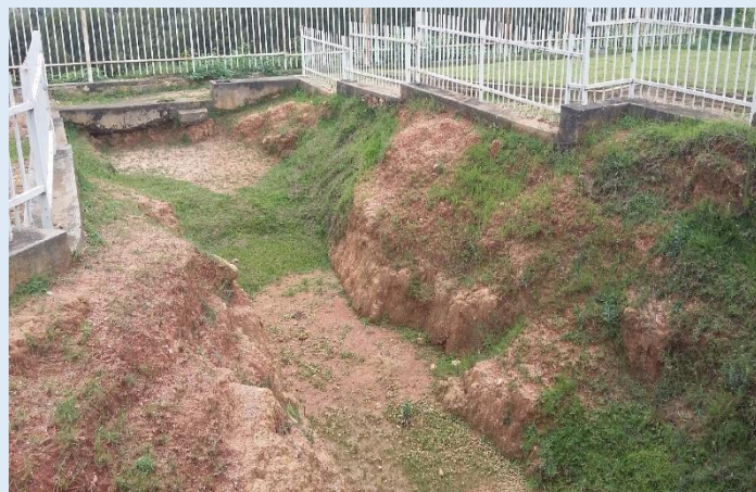
Mass grave at Murambi Genocide Site