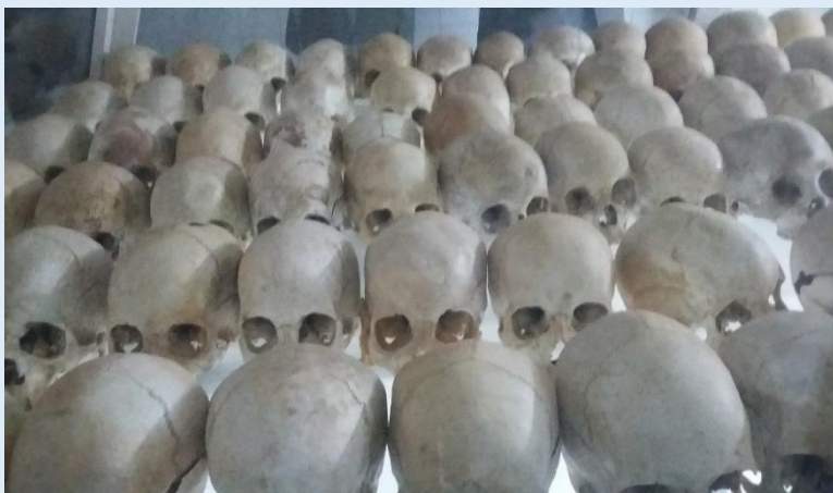
Hominid remains exhibited at Nyamata Genocide Site