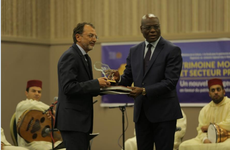
Handing over the Award of Excellence to Hon. Mohammed Amine Sbihi, Minister of Culture of Morocco

OVER 200 000 USD RAISED! Pledges were made by the Ministry of Culture of Morocco (100,000USD), the General Confederation of Enterprises in Morocco (100,000 US), the Group Allali (10,000USD) and the Ministry of Culture of Burkina Faso (5,000,000 CFA).