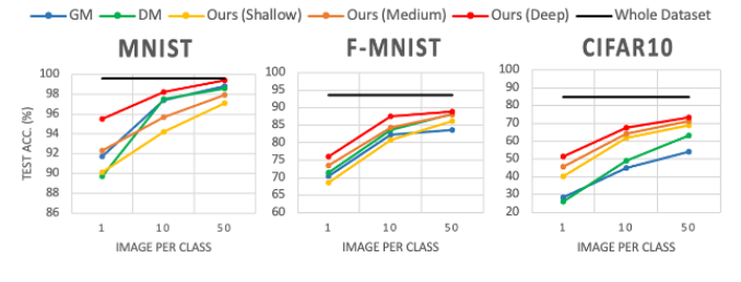
Fig. 3. Test accuracy comparison between our model with different depth of Autoencoder, GM and DM Architectures in Different datasets

Figure 3 presents the empirical results of our experiments, graphing the test accuracy achieved by each autoencoder architecture on the different dataset. The x-axis plots the number of images per class (Img/Cls) used during training, serving as a measure of dataset size and richness. The y-axis quantifies the test accuracy, providing a clear performance metric for each model. The lines for each architecture variant—Shallow, Medium, and Deep—converge towards the accuracy obtained when the entire dataset is leveraged for training, depicted by the 'Whole Dataset' line. These results are instrumental in understanding how the depth of an autoencoder affects its capacity for dataset condensation and subsequent classification