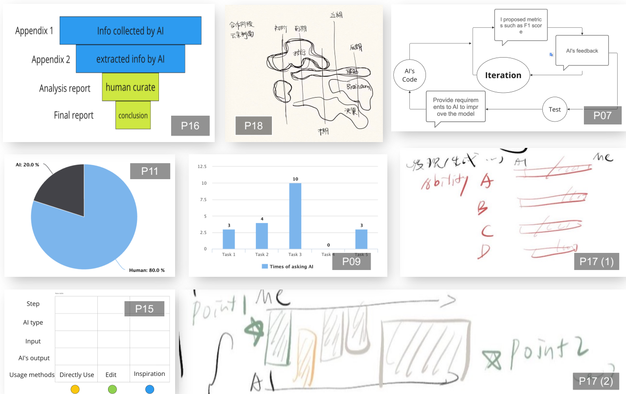
Figure 3: A subset of designs of the reporting of students' AI usage resulted from step 2 of activity 3 of the co-design workshop. We explain the designs when we mention them in the main text.

insights, which we refer to as framing idea . Nevertheless, not every usage analysis has corresponding data framing, possibly limited by participants' data and visualization literacy, but it is worth future research.