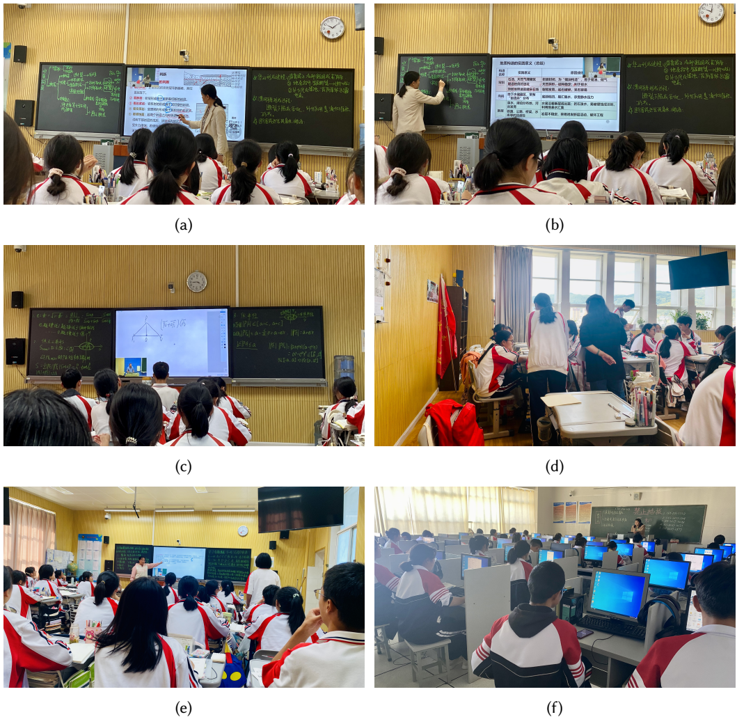
Fig. 2. Several LSRC class scenarios. (a) is a geography class, where the local teacher uses a pen to guide students' attention to specific content and highlights key points on the presentation slides. (b) showcases the geography teacher outlining the class's knowledge structure on the local blackboard. (c) is a mathematics class, with the math teacher writing down essential formulas on the local blackboard. (d) is a physics class wherein the local teacher is organizing group discussions. (e) is a history class, with the teacher interacting with students. (f) is a non-LSRC English class organized by the local teacher to enhance students' English listening skills.

“You might think our lesson preparation pressure is reduced since we are not lecturing. It is quite the opposite. We prepare even more thoroughly than before. It is essential to anticipate where students might face challenges and prepare necessary materials from textbooks and supplementary sources. For instance, if students struggle with certain words or sentences, laying the groundwork beforehand is crucial, or they will have difficulties during the class.” (P7)