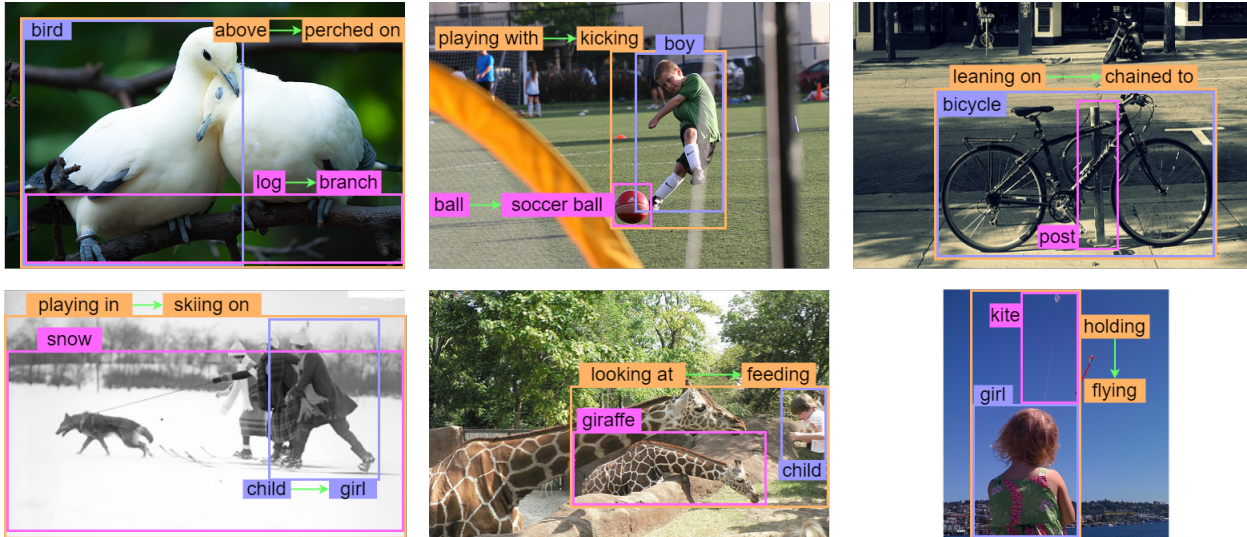
Figure 2. Visualizing Diffusion-Augmentation based results on GQA-LT dataset. Here, the green arrows show how the predicted subject/relation/object changes after fine-tuning LSVRU (with CE loss) model using DiffAugment. Orange color denotes the relation, blue denotes the subject, and pink denotes the object.

based sampling, Hardness conditioned Diffusion and Curriculum based fine-tuning in all possible combinations. The overall relation + subject/object average per-class accuracy for each configuration is reported in Table 5. As the table shows, adding each of the enhancements generally improves the overall accuracy, however, the optimal strategy may involve using only some of the enhancements (like not using curriculum based fine-tuning in this case).