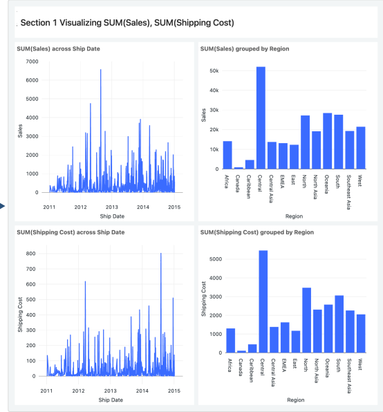
Fig. 1: The Quick Dashboard system allows users to rapidly specify dashboards by choosing metrics and dimensions of interest from a data table. (1) A user begins by using the Quick Dashboard UI to choose metrics and dimensions for each section of their dashboard. In this example, the user has selected two metrics (Sales and Shipping Cost) and two dimensions (Ship Date and Region). (2) The UI creates a corresponding dashboard specification for the user's input. (3) The system then generates the final dashboard by combining each metric and dimension according to the specification. This dashboard can be used immediately or further customized by changing the chart types or re-arranging components.

Abstract — Despite their ubiquity, authoring dashboards for metrics reporting in modern data analysis tools remains a manual, time-consuming process. Rather than focusing on interesting combinations of their data, users have to spend time creating each chart in a dashboard one by one. This makes dashboard creation slow and tedious. We conducted a review of production metrics dashboards and found that many dashboards contain a common structure: breaking down one or more metrics by different dimensions. In response, we developed a high-level specification for describing dashboards as sections of metrics repeated across the same dimensions and a graphical interface, Quick Dashboard , for authoring dashboards based on this specification. We present several usage examples that demonstrate the flexibility of this specification to create various kinds of dashboards and support a data-first approach to dashboard authoring.