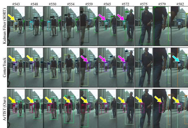
Figure 3. Qualitative result of handling occlusion in a moving camera scenario where colored arrows point to the bounding boxes of the pedestrian of interest and changing in the color of arrows shows a change in the identity of that pedestrian. Unlike Kalman Filter [5] and CenterTrack [70], our method preserves the identity after two occlusions and also inpaints the bounding boxes in occlusions. Note, all the methods are using exactly the same detections.

Effect of Bounding Box Refinement. A number of re-