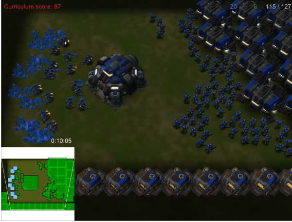
Fig. 2. An example of the render interface of SC2LE

on two levels of gameplay: individual unit movement, often referred to as “micro”, and overall strategy, often referred to as “macro”. For a player to be able to achieve a strong position, they typically have to control and monitor their resource gathering units, use the resources they’ve gathered to create buildings and upgrade their technology, as well as amassing their army to defend their base and eventually attack their opponent’s base. However, since resources are limited and can only be collected at a certain rate, the player has to strategically plan which technology to invest in, which types of units to build, and how many of each type. Human players often follow certain patterns in their macro strategies, and continue to test and refine them. These patterns of macro strategy are known as a build order, and can be thought of as similar to an opening in the game of Chess.