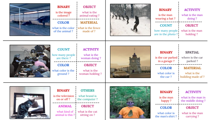
Figure 3: Questions generated for each image from multiple answer categories using C3VQG approach.

Using multiple constraints on latent space reduces the performance slightly for Bleu-2 and Bleu-4 , but we observe significant increase in other language modelling metrics. We leave certain values for ROUGE-L blank in Table 1 as some prior works [9, 29] did not employ it for their evaluation.