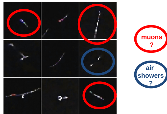
Figure 3: The variety of particle tracks candidates as registered by a smartphone using the CREDO Detector app [6].

detection with PC/laptop cameras (Windows) and Pi Cameras using Raspberry Pi (Linux). The CREDO data is being stored, processed and made available continuously in the CREDO central computing system operated by ACC Cyfronet AGH-UST, in Krakow, Poland. The data center is open on two ends: every experiment or private detector can submit own data, if it only matches the API protocols. Also the access to data is open to the registered users with scientific or educational motivations. All the CREDO codes are open under the MIT license - so that the community of participants can also get engaged in software development - for science and for their education. The key scientific achievement to date is the launch and first data analysis in Quantum Gravity Previewer - the first mass participation on-line experiment on the CREDO infrastructure dedicated