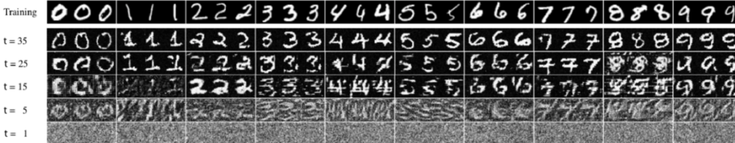
Figure 2: Synthesized pseudo-negatives for the MNIST dataset by our ICN classifier. The top row shows some training examples. As t increases, our classifier gradually synthesizes pseudo-negative samples that become increasingly faithful to the training samples.

We conduct experiments on three standard benchmark datasets, including MNIST, CIFAR-10 and SVHN. We use MNIST as a running example to illustrate our proposed framework using a shallow CNN; we then show competitive results using a state-of-the-art CNN classifier, ResNet [12] on MNIST, CIFAR-10 and SVHN. In our experiments, for the reclassification step, we use the SGD optimizer with mini-batch size of 64 (MNIST) or 128 (CIFAR-10 and SVHN) and momentum equal to 0.9; for the synthesis step, we use the Adam optimizer [17] with momentum term \beta_1 equal to 0.5. All results are obtained by averaging multiple rounds.