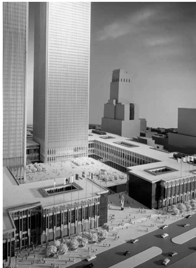
Fig. 2 - Minoru Yamasaki, World Trade Center, Model , 1964