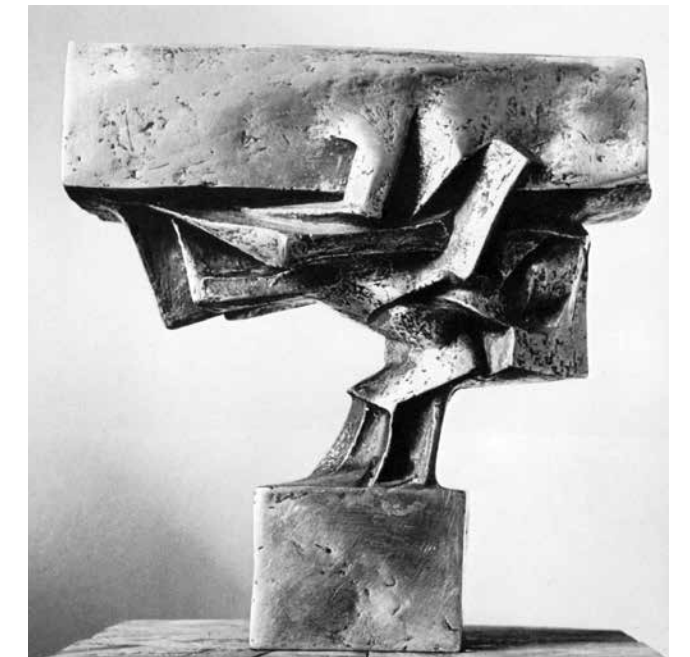
Fig. 9 - Fritz Koenig, Caryatid II , 1965