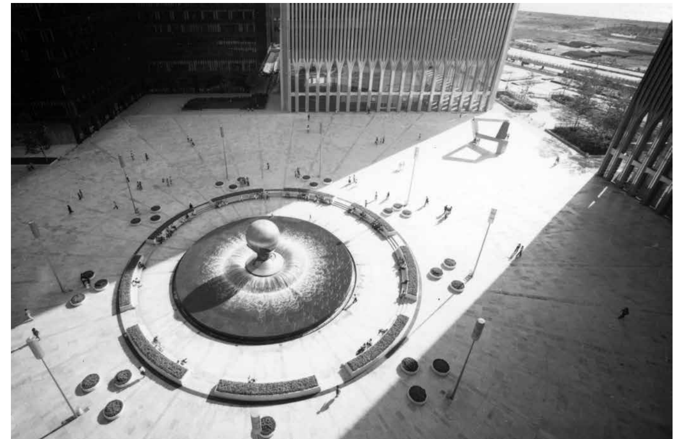
Fig. 4 - Minoru Yamasaki, World Trade Center Plaza with the Great Caryatid Sphere, N.Y. , 1972