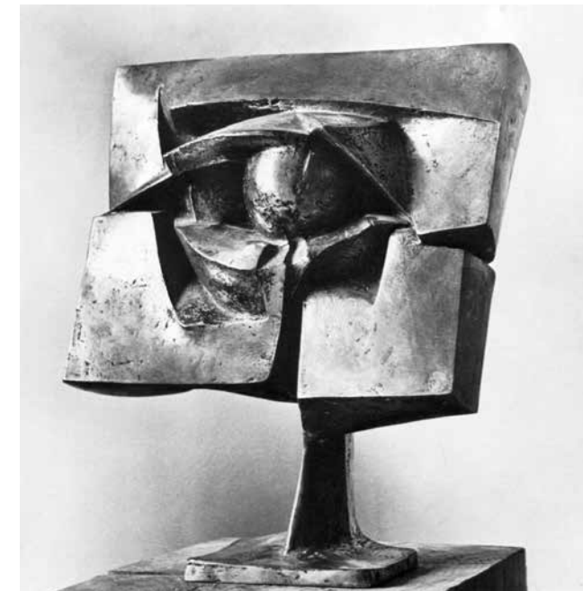
Fig. 7 - Fritz Koenig, Eye Votive I , 1965 (cat. no. 27)