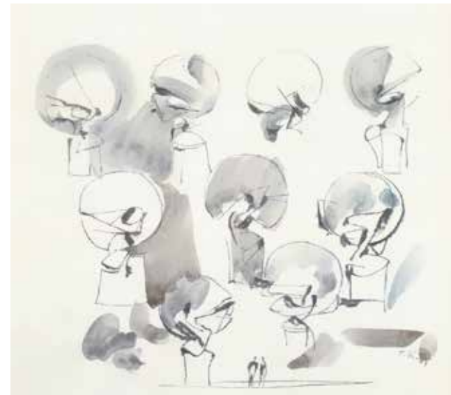
Fig. 5 - Fritz Koenig, Large Cross VI , 1966 (cat. no. 29)