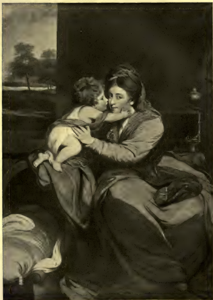
VISCOUNTESS MELBOURNE AND HER ELDEST SON PENISTON LAMB After the picture by Sir Joshua Reynolds, P.R.A.