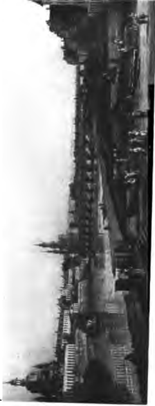
The Birch Terrace, President. From the picture by Comalotto.