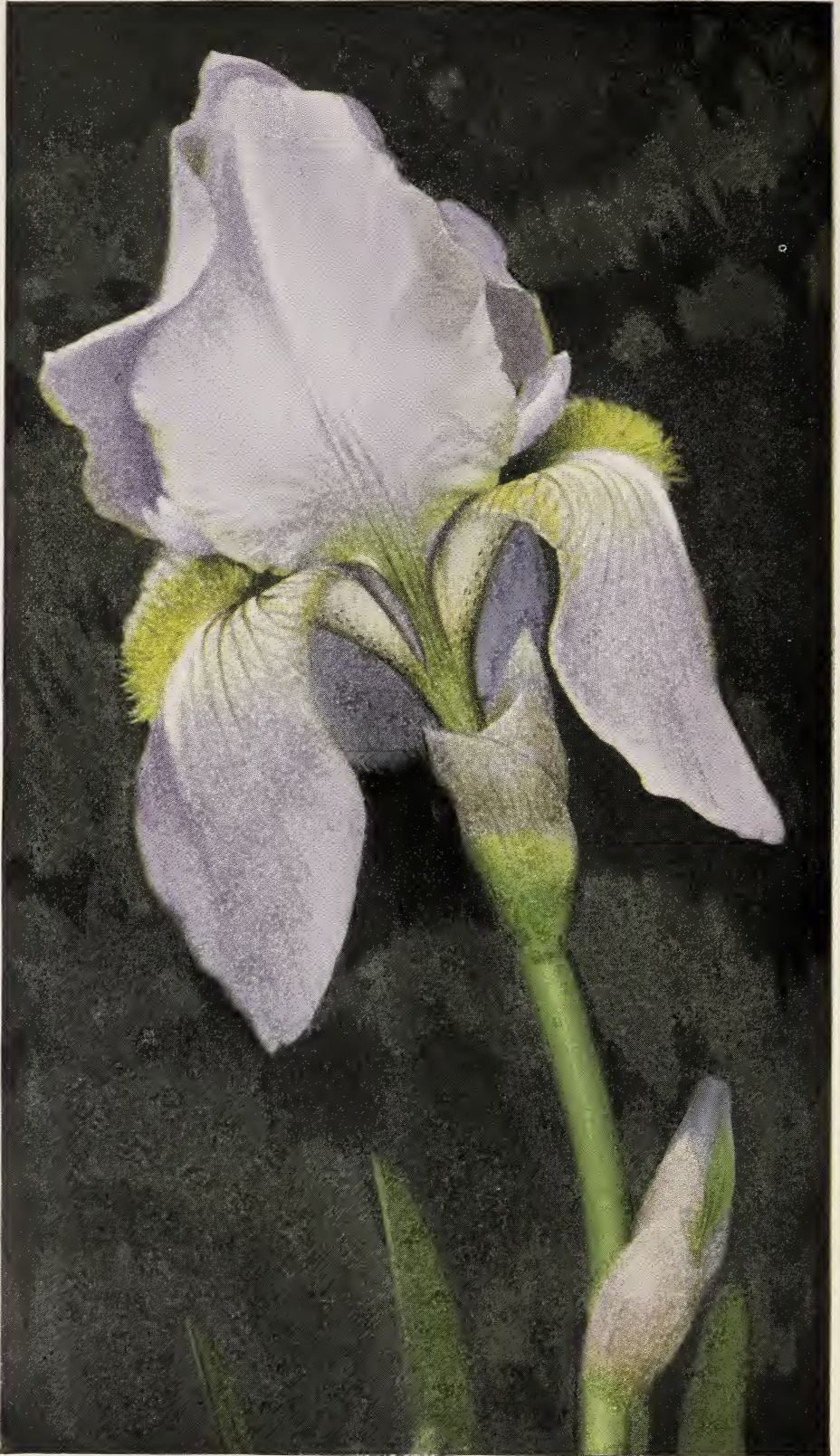
MOTHER OF PEARL (Sturtevant) See Page 26