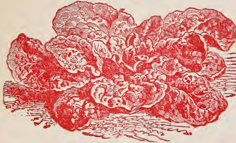
Buist's Perfection Curled Spinach.