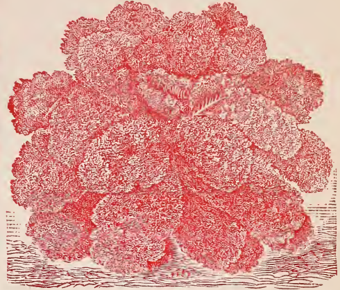
Dwarf Curled Berlin Kale.