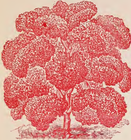
Curled Intermediate Kale.