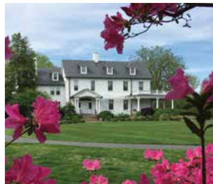
River Farm has served as the headquarters of the AHS for nearly half a century.

Another major project AHS took on was overseeing the AHS Plant Records Center (PRC) in 1968 at the Tyler Arboretum in Lima, Pennsylvania. Funded by grants from the Longwood Foundation, the project was the first attempt to computerize plant re-