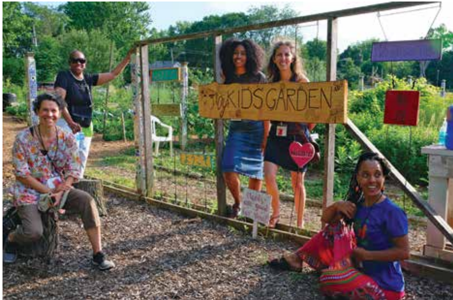
Attendees at the AHS's National Children & Youth Garden Symposium in Wisconsin in 2019.

ing, and development of The Growing Connection, an international educational program for middle-school students established in 2003 in partnership with the Food and Agricultural Organization of the United Nations.