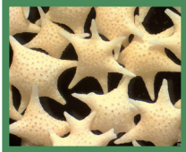
Clumped CO 2 Isotopes*