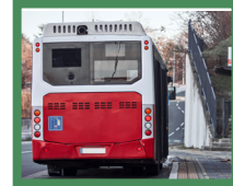
NO, NO 2