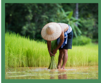
CH 4 Isotopes