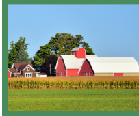
N 2 O Isotopes