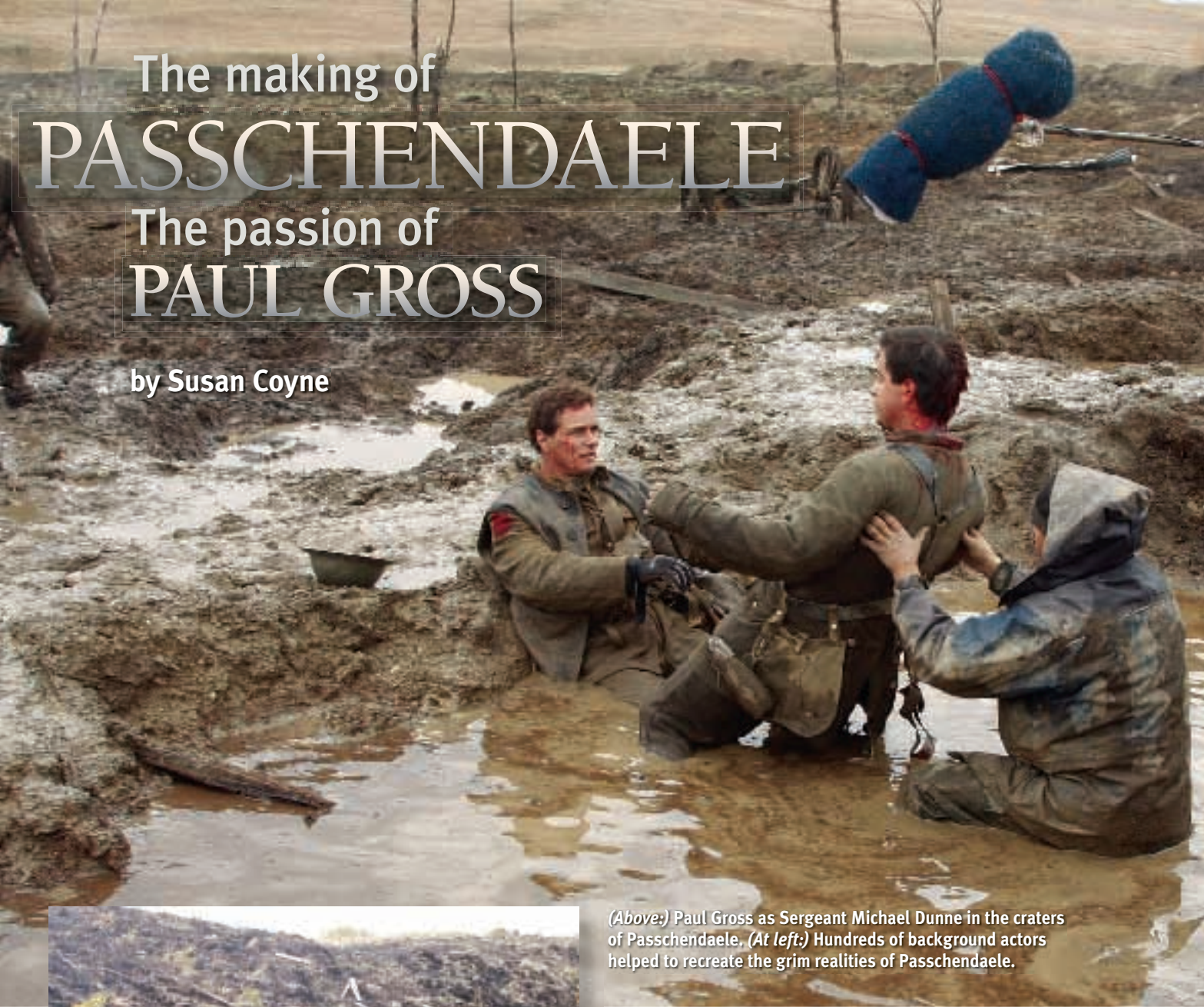
(Above:) Paul Gross as Sergeant Michael Dunne in the craters of Passchendaele. (At left:) Hundreds of background actors helped to recreate the grim realities of Passchendaele.