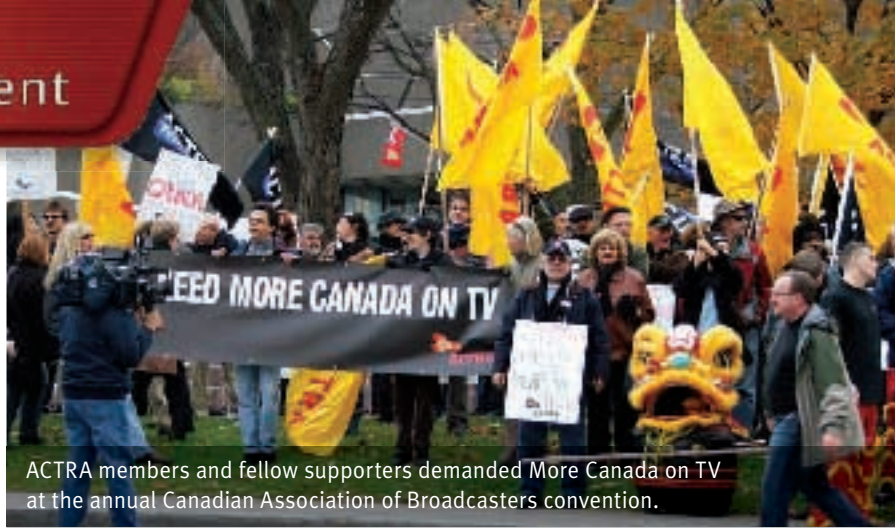
ACTRA members and fellow supporters demanded More Canada on TV at the annual Canadian Association of Broadcasters convention.

It's a shame that the Minister of Heritage, who has acquired a better understanding of the tenuous stability of our