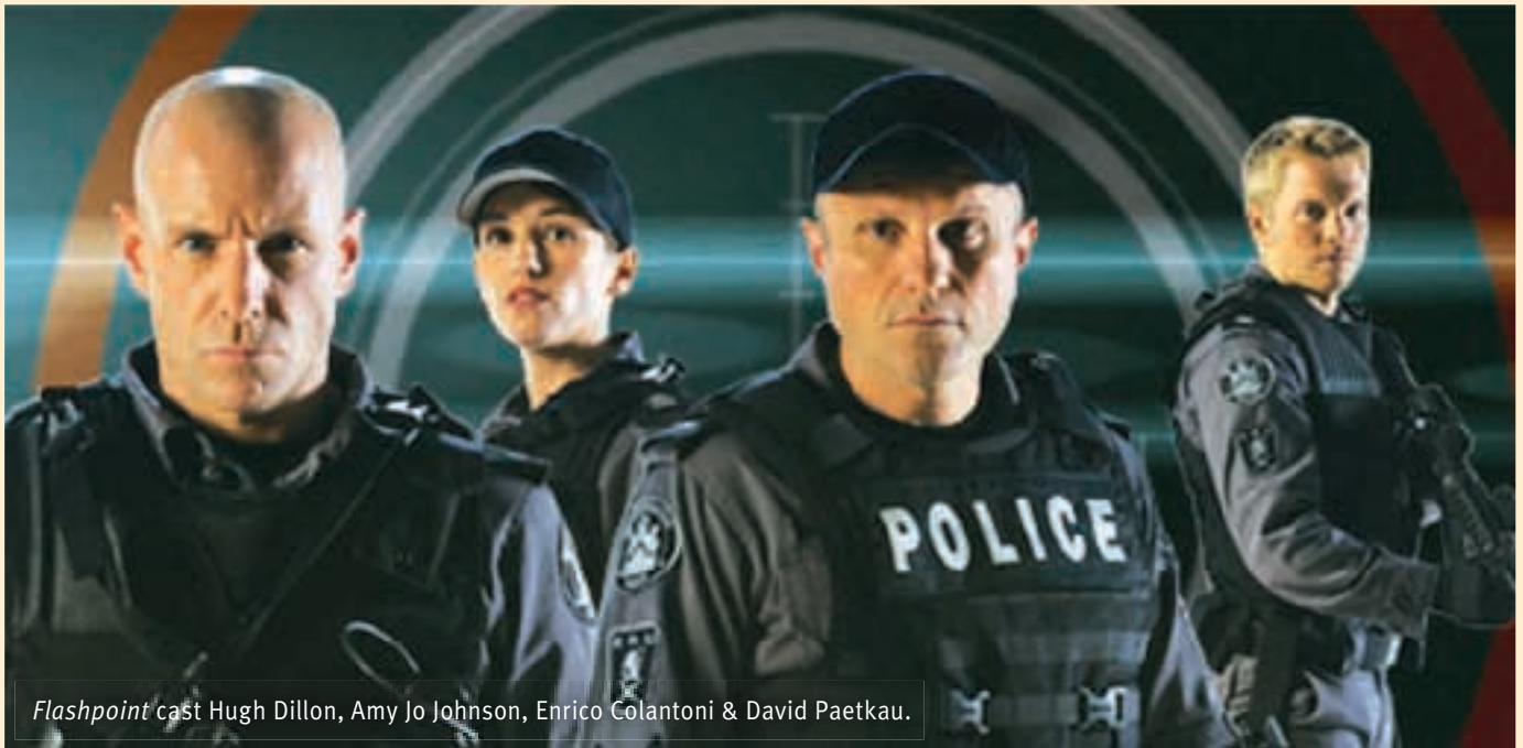
Flashpoint cast Hugh Dillon, Amy Jo Johnson, Enrico Colantoni & David Paetkau.