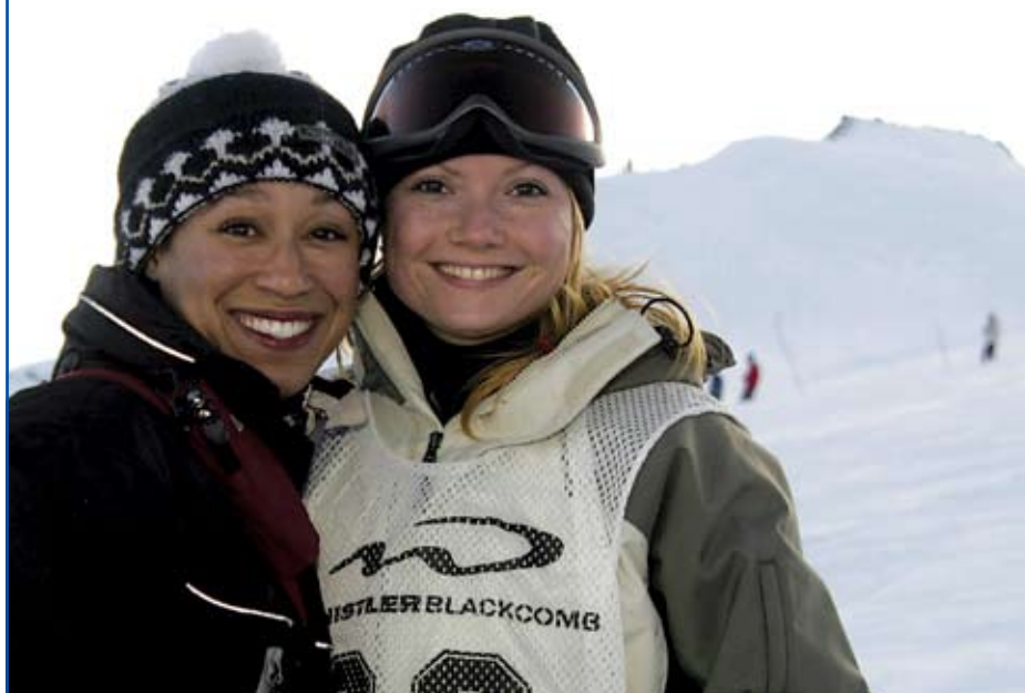
Andy Dittich/Whistler Film Festival