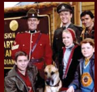
The Forest Rangers in the 1960s.