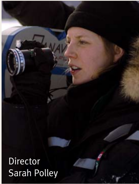
Director Sarah Polley

“There is a time in every man’s education when he arrives at the conviction that envy is ignorance; that imitation is suicide; that he must take himself for better, for worse, as his portion; that though the wide universe is full of good, no kernel of nourishing corn can come to him but through his toil bestowed on that plot of ground which is given to him to till.”