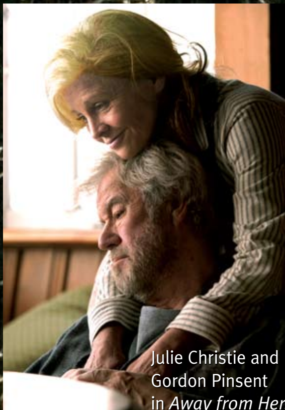
Julie Christie and Gordon Pinsent in Away from Her .