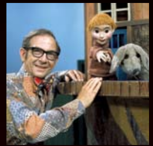
Mr. Dressup with Casey and Finnegan in the late 1960s.