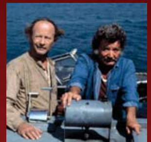
The Beachcombers in the early 1980s.