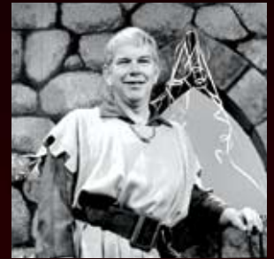
Bob Homme as The Friendly Giant (1960s).