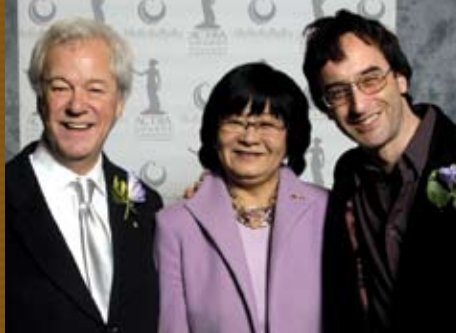
Outstanding Performance Award Winner Gordon Pinsent, Heritage Minister Bev Oda and Nominee Don McKellar.