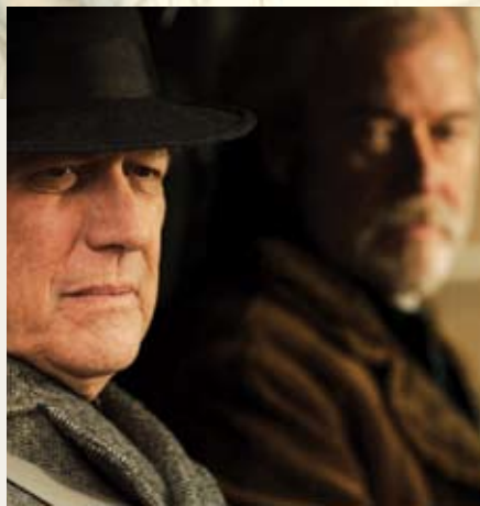
Michael Murphy and Gordon Pinsent in Away from Her .

think that you make something universal by making it generic. I think you make it universal by being very specific and authentic to the place you’re representing. For me, I was very, very proud that this film was in the tradition of films that were not disguising their identity. When the film gets shown elsewhere people respond to a film that feels like it’s set in a very specific place. It’s not an obstacle for them. I think as Canadians we’re constantly worried about that and I don’t think it’s based on anything except our own, you know, insecurity.”