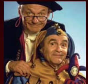
Wayne & Shuster Special: Once upon a Giant , 1988.