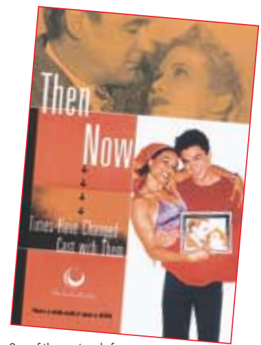
One of the postcards from ACTRA Toronto Performers' diversity campaign

On Feb. 15th we initiated our Members' Conference entitled, 'Making Connections – With Your Art and Your Industry.' This year ATP evolved our AGM into a full day