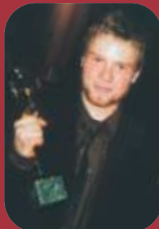
The youngest-ever (20 year-old) Best Actor Brendan Fletcher.