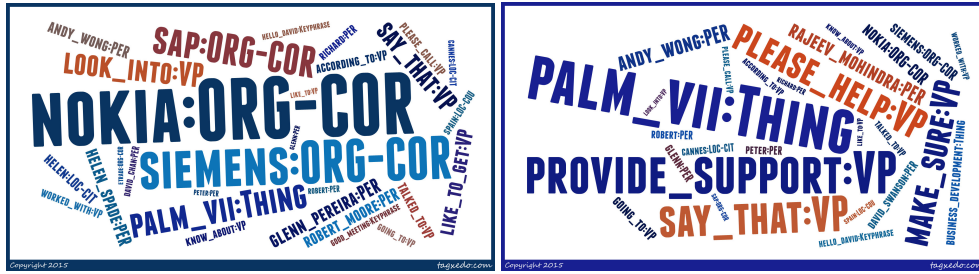
Figure 2: Word clouds of activity tokens.

body words not providing additional value in their task classification work. However, the GrausB(VP–TOI) in row (7) shows that using body terms more selectively has the potential for improving performance. Comparatively, the use of observed recipients (GrausR in row (8)) substantially improved recommendation results, yielding the highest MRR , precision@1 , and precision@2 scores, while the generative baseline in row (5) retained the highest precision@5 and precision@10 scores.