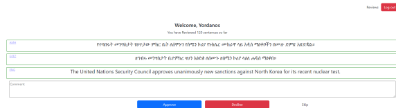
Figure 4: Interface of our in-house system receiving all the data.