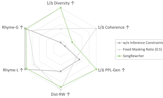
Figure 4: Ablation results on the generated outputs on the task of full song rewriting. To facilitate comparison, all metrics are normalized to 0-1 range by the respective maximum values. The exact scores are presented in Table 8 in Appendix H.

masked fragments. For the remaining 20% masked tokens with vowel inputs, we calculate the ratio of output tokens with the same vowel as the input ( vowel accuracy ). We found that the proposed model is able to consistently generate tokens of pre-defined vowels around 98% of the time under various masking schemes and masking ratios, 17 implying that the model can generate user-defined rhyme schemes by providing rhyming vowel to the target positions in the input most of the times.