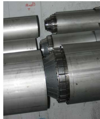
Figure 3: view of welding machine

These tools avoid tack welding and limit purging time. Unfortunately the CENTRATOR machine requires axial access to introduce it. When we could not use them, we used expendable balloon. In this case it was necessary to tack weld and the purging time was longer.