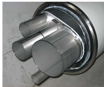
Figure 1: end of pipe element before welding

To connect these elements: more than 3200 junctions have been welded (one junction = welding of inner pipes + external pipes). For each junction we have welded: