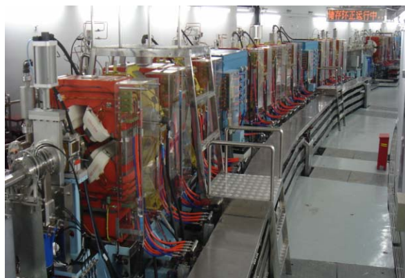
Figure 1: One sector of the machine in the tunnel

In order to check the overall design and confirm the installation procedure, a pre-test installation for a half arc sector using the prototype components and a full-test installation and system test for one arc sector using the first group components are respectively carried out at the SINAP site in middle of 2006 and in the SSRF tunnel and technical gallery at the end of 2006. Based on the experience, the installation of the SSRF storage ring was started on June 11, 2007. The pre-alignment of the Girder-magnet assembly and the pre-processing of the vacuum system were carried out in the experimental hall. Then the assemblies were sent to ring tunnel using crane for alignment. The installation of the storage ring was completed successfully at the beginning of December, 2007. Figure 1 shows the machine in the tunnel.